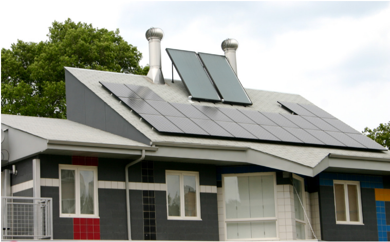
1. House with solar panels and wind turbine vents

Do these images remind you of anything that you do or have seen others do?