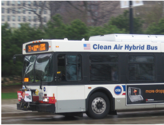
1. Clean air hybrid CTA bus

Do these images remind you of anything that you do or have seen others do?