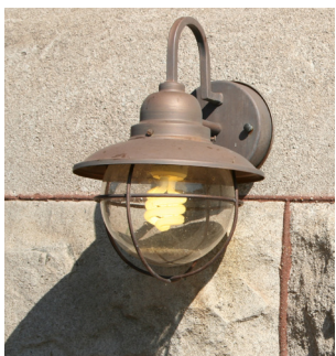
7. Outdoor lighting fixture with CFL bulb