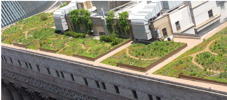
1. Green roof

Do these images remind you of anything that you do or have seen others do?