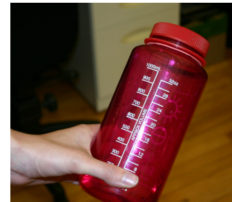
4. Reusable water bottle