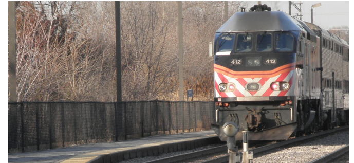
6. Commuter train