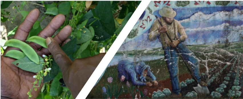
6. Agricultural heritage in the city