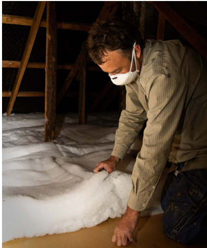
4. Insulating a home