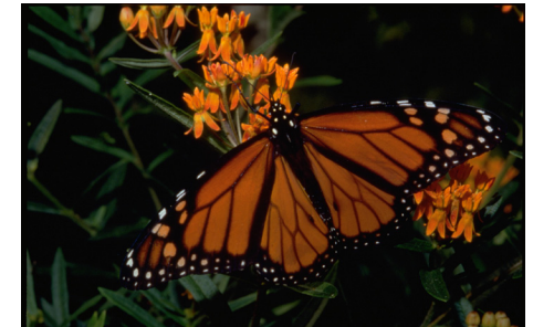
8. More than a butterfly