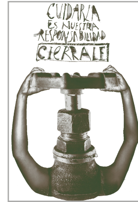
3. Public campaign