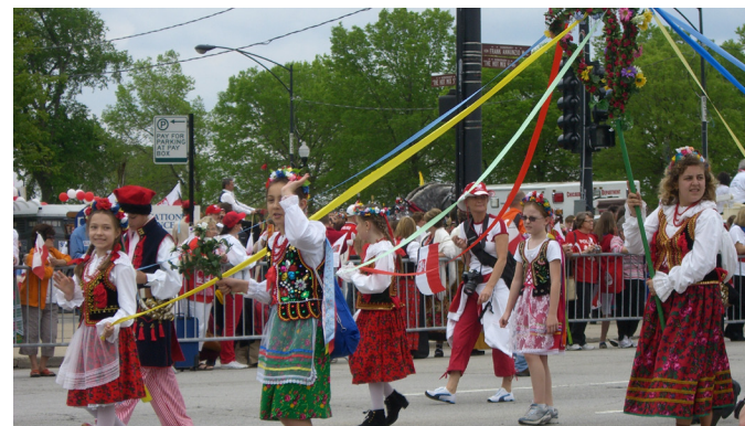
10. Polish Maypole