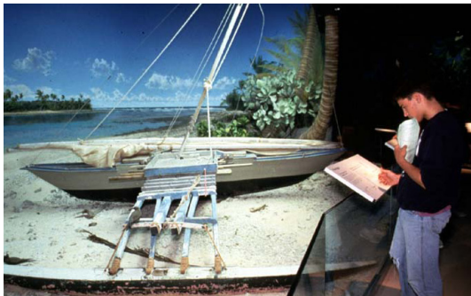
4. Getting around on water