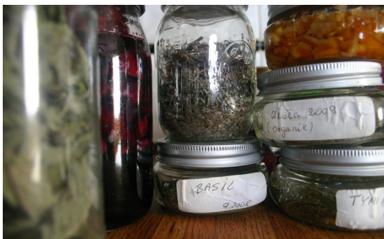
8. Reusable containers