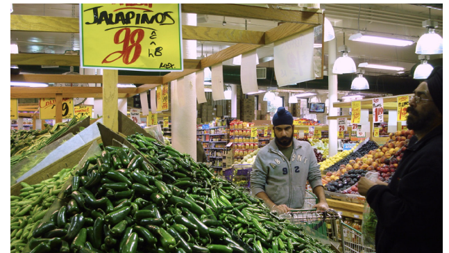
6. Shopping for vegetables