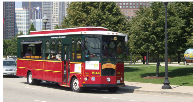
5. South Chicago Trolley