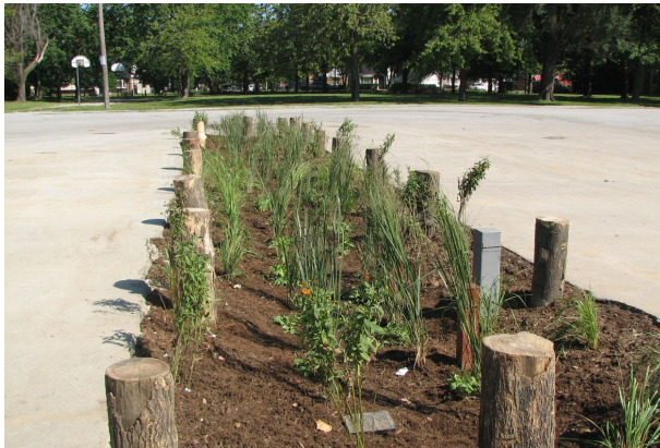
1. Parking lot bioswale

Do these images remind you of anything that you do or have seen others do?