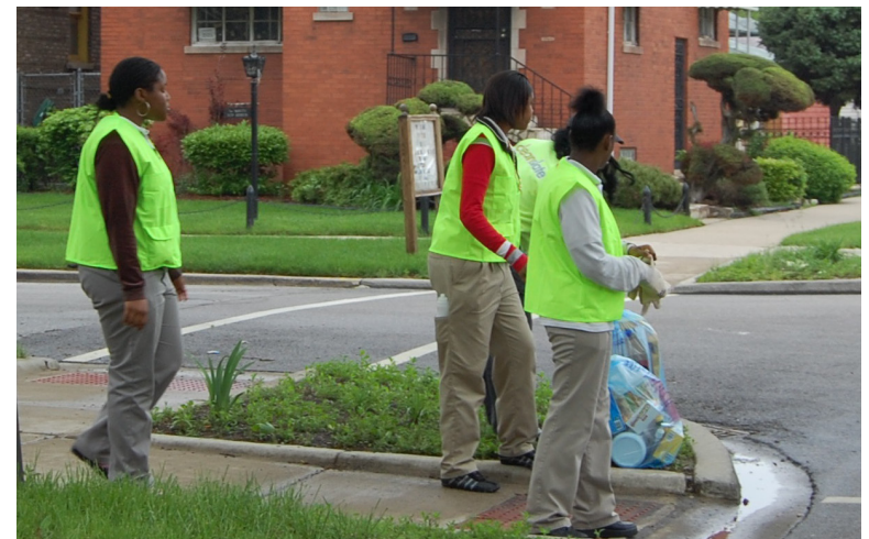
10. Youth door-to-door recycling program