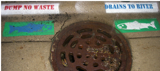
5. Storm sewer sign: "Dump no waste — drains to river"