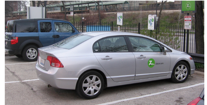
3. Fuel efficient "car sharing" vehicles