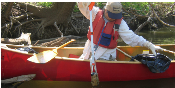
9. Canoeing and cleaning