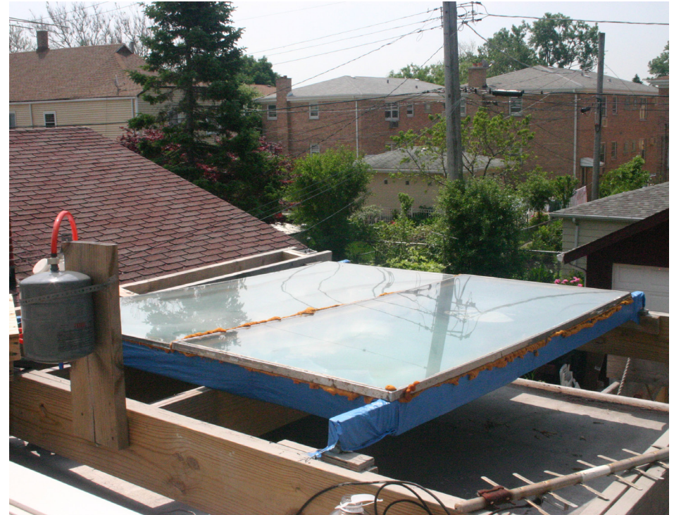
7. Do-it-yourself solar energy