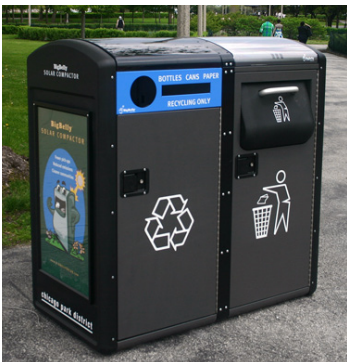
5. Solar trash compactor