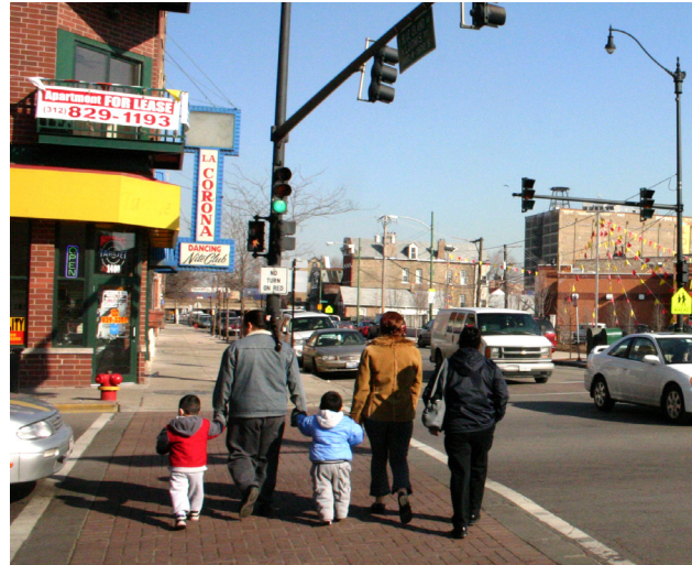
2. Walking as transit