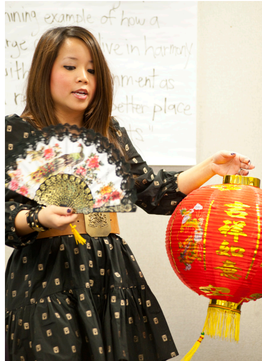
6. Folding fan and paper lantern