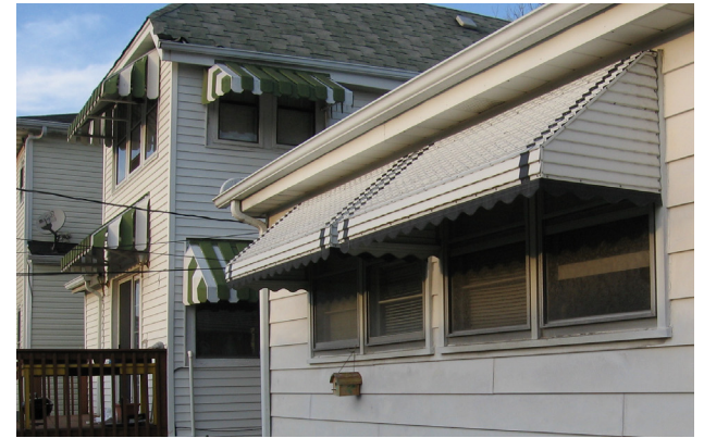
3. Residential homes with window awnings