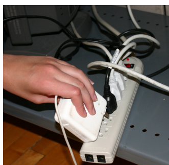
8. Unplugging charger