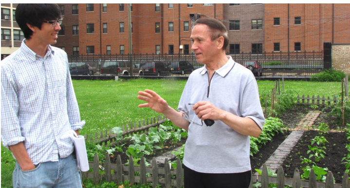
9. Urban community garden