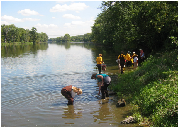
6. Assessing stream health