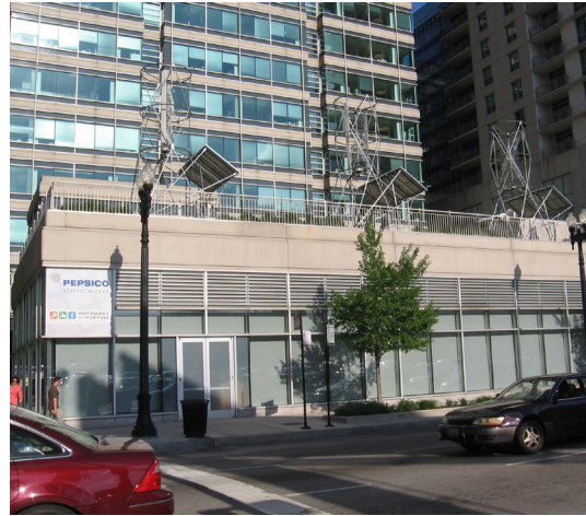
2. Rooftop wind turbines