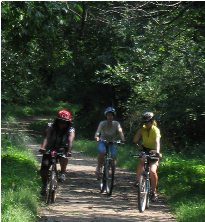
1. Biking in Cook County Forest Preserve

Do these images remind you of anything that you do or have seen others do?