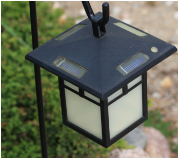
4. Solar powered lawn lights