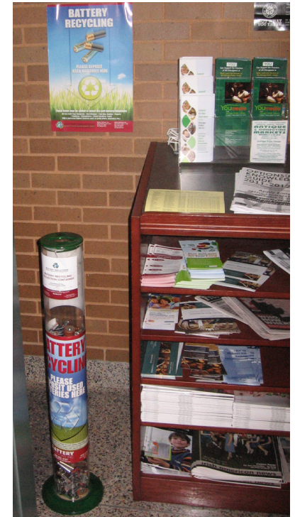
5. Battery recycling