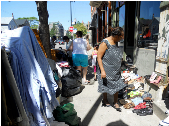
1. Swap meet/flea market

Do these images remind you of anything that you do or have seen others do?