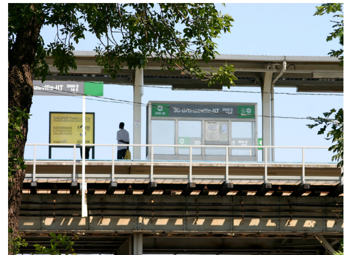
9. CTA train stop