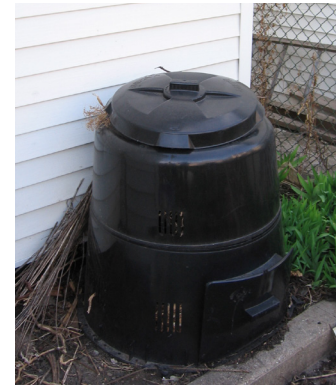
3. Compost bin