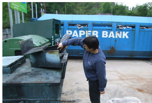
9. Recycling used motor oil