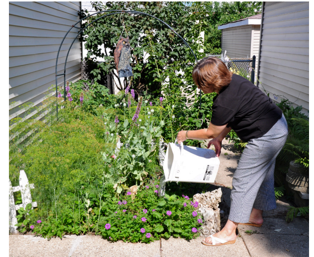
7. Reusing grey water