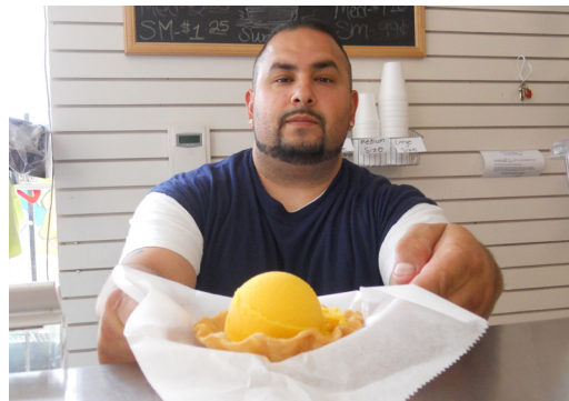
7. Edible bowls