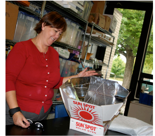
3. Solar oven