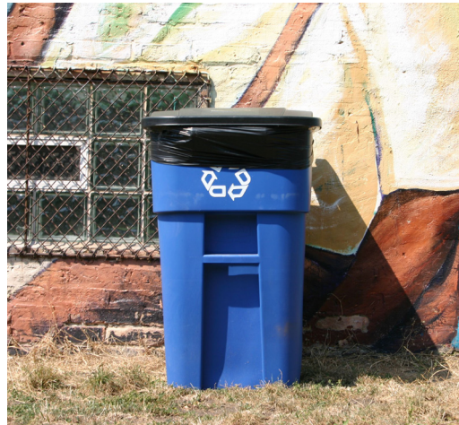
2. Recycling bin