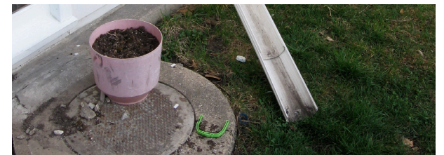
10. Rain gutter emptying into lawn