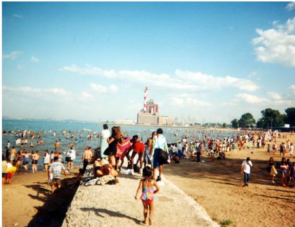
8. Enjoying the beach