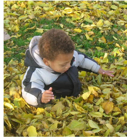
3. Playing outdoors