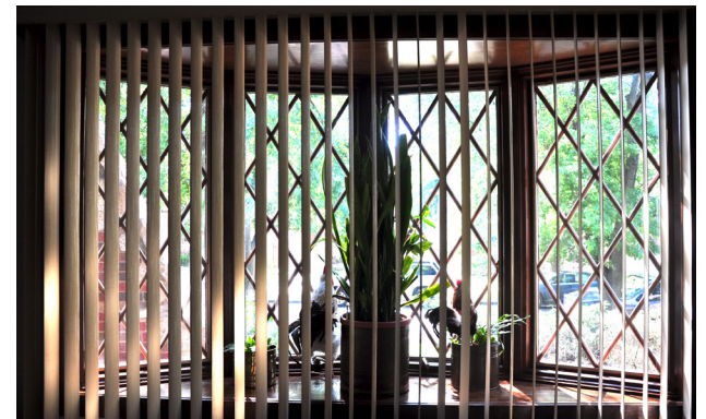
10. Residential home with window coverings