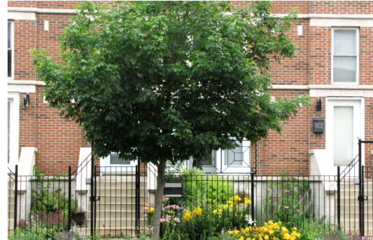
7. Yard with tree and plants