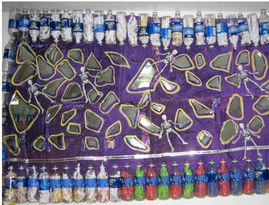
6. Creative reuse