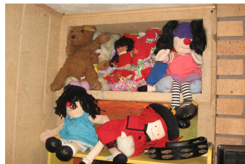
9. Stuffed toy insulation