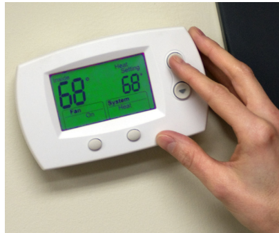
2. Programmable thermostat