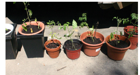
11. Container garden