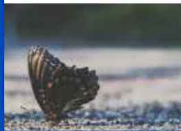
Bugs on the ground