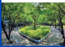
Grass in a garden