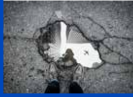
Water in a pothole