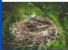
Nest in a tree or on a building