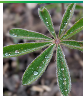
4 Lupinus perennis Blue lupine