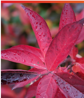
1 Cornus sericea Red-osier dogwood

To learn more, visit shorturl.at/djuvH .