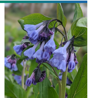
5 Mertensia virginica Virginia bluebells