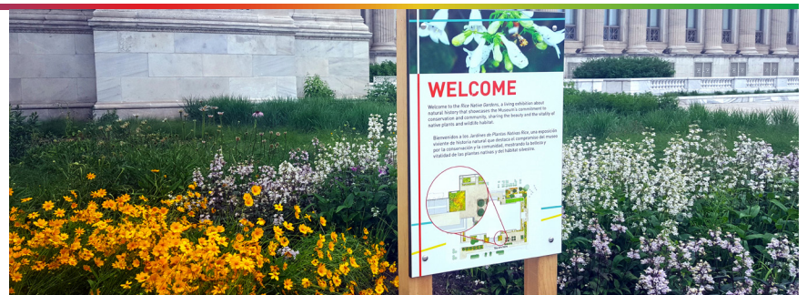
The Rice Native Gardens, The Field Museum, Chicago, Illinois