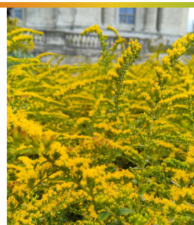
9 Solidago rugosa 'Fireworks' Rough goldenrod