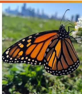
2 Danaus plexippus Monarch butterfly