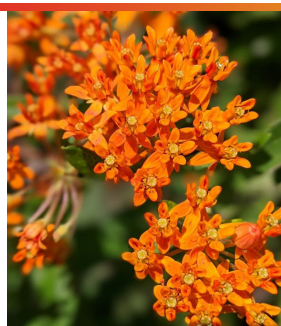
8 Asclepias tuberosa Butterfly weed