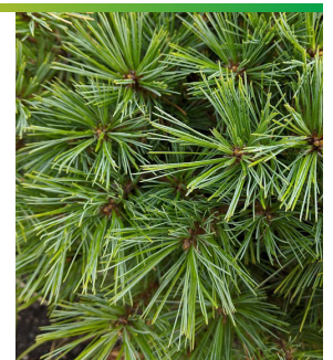
10 Pinus strobus 'blue shag' Dwarf eastern white pine