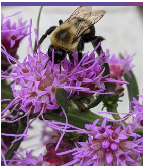
6 Liatris aspera Rough blazing star