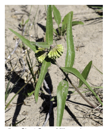
Short Green Milkweed Asclepias viridiflora

This milkweed is found in high quality remnant areas, often with sandy and well drained soils or in gravel or hill prairies. It is not too showy, with greenish flowers and short stature.