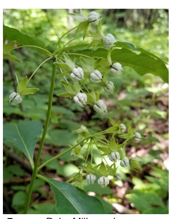
Poke Milkweed Asclepias exaltata

This uncommon milkweed has beautiful deep purple flowers and can grow up to 3 feet tall.