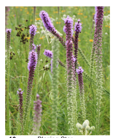
Blazing Star Liatris spicata

This grass grows in a bunch with singular leaves sticking out. It is a great addition to any garden, adding texture and providing shelter for pollinators.