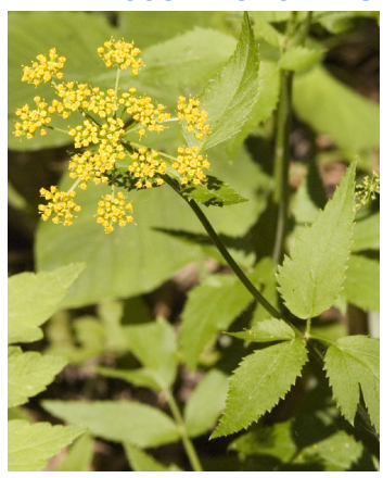
Golden Alexanders 7izea aurea

A host plant for the swallowtail butterfly, this spring bloomer has bright yellow flowers arranged in an umbel - a grouping of short stalks that end with flowers.