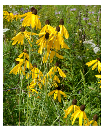
Yellow Coneflower Ratibida pinnata

The small blue flowers attract a lot of pollinators and are delicate and attractive in the garden.