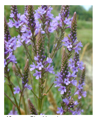
Blue Vervain 13 Verbena hastata

The small blue flowers attract a lot of pollinators and are delicate and attractive in the garden.