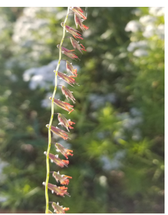
Side Oats Gramma 15 Bouteloua curtipendula

Tall flowers with yellow drooping petals. The aromatic seeds are a favorite to may local birds.