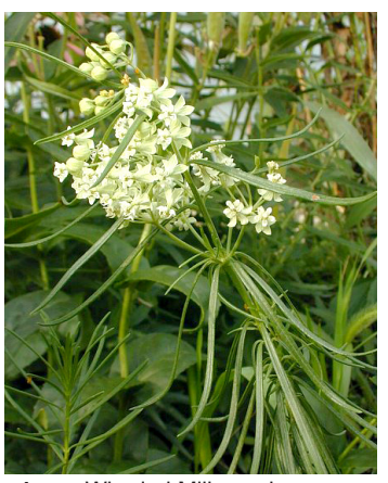
Whorled Milkweed Asclepias verticillata

A shorter milkweed, usually around 1-2 ft tall with bright orange flowers. This is a showy plant that can easily become a center piece of any garden if the growing conditions are right.