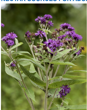
Common Ironweed Veronia fasciculata

Common ironweed has bright purple flowers that will brighten any garden and attract many pollinators. Xerces society also lists this plant as having particular value for other pollinators as well.