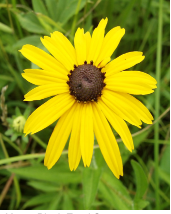
Black Eyed Susan 12 Rudbeckia sp.

Many gardeners might have a species or its horticultural variety in the garden. The plants are charming, and not too tall, and have the added benefit of familiarity.