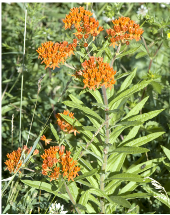
Butterflyweed Asclepias tuberosa

Stems up to 5 ft tall with long elegant leaves and bright pink flowers that attract an array of pollinators.