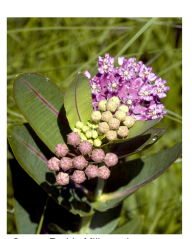
8 Prairie Milkweed Asclepias sullivantii

A tall milkweed that prefers shade and non-windy conditions. It has two colored flowers that provide a white and green color contrast.