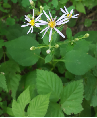
Big Leaf Aster Eurybia macrophylla

Goldenrods brighten any garden in fall. Stiff goldenrod has a stout stem and culminates in round bunch of flowers. Pair with a blue aster for a beautiful color composition