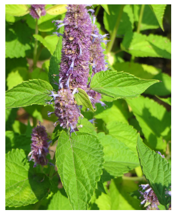
Anise Hyssop 10 Agastache foeniculum

A showy bloom attracting many pollinators, this plant is more common in natural communities further southwest but has been a native gardener's favorite for some time.