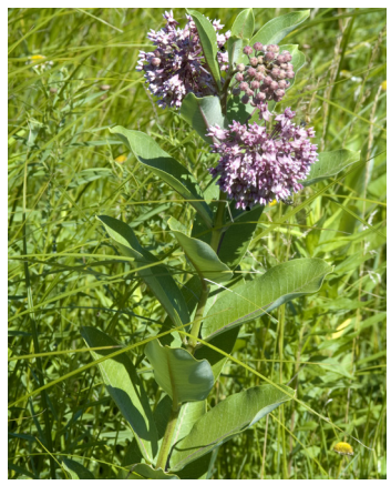
Common Milkweed Asclepias syriaca

This is the most frequently encountered milkweed in the region and a favorite of the monarch butterfly and other pollinators. It reaches a height between 4-6ft and spreads through underground roots called rhizomes.