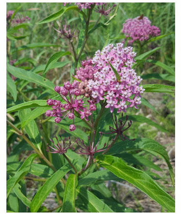
Rose Milkweed Asclepias incarnata

Stems up to 5 ft tall with long elegant leaves and bright pink flowers that attract an array of pollinators.