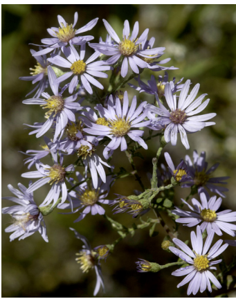
23 Short's Aster Symphyotrichum shortii

This medium size plant reaches about 3 feet and can be carpeted with lavender colored flowers in the fall