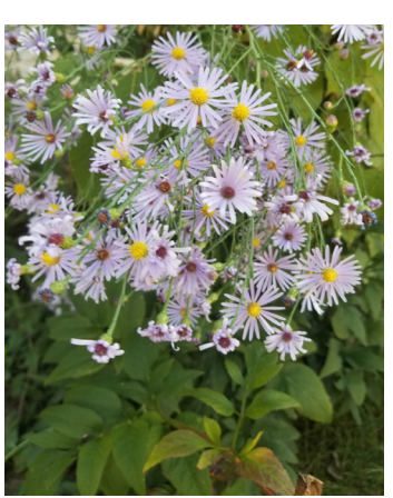
22 Smooth Blue Aster Symphyotrichum laeve

This late blooming aster adapts well to almost any setting and will add instant color to your garden in the fall. Pair with a goldenrod for a beautiful color contrast.