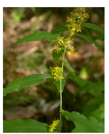
Blue Stem Goldenrod Solidago caesia

This beautiful goldenrod has delicate small yellow flowers blooming along the stem. This species remains in the area where it was planted and does not spread easily.