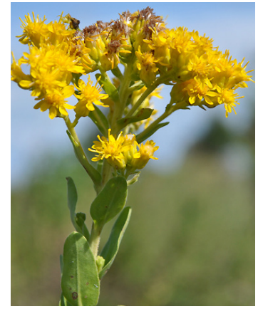
19 Stiff Goldenrod Oligoneuron rigidum

Goldenrods brighten any garden in fall. Stiff goldenrod has a stout stem and culminates in round bunch of flowers. Pair with a blue aster for a beautiful color composition