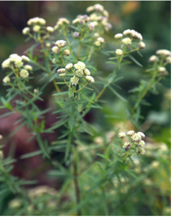
Mountain Mint Pycnanthemum virginianum

This plant grows many-branched stems with small, intensely smelling leaves. The flowers are small, white and dense. Plant preserves well into winter.