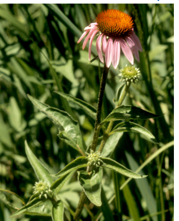
Purple Coneflower Echinacea purpurea

Lovely and colorful plant with an open flower on a stout stem. This plant has many recorded medicinal and cultural uses