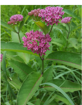
Purple Milkweed Asclepias purpurascens

This uncommon milkweed has beautiful deep purple flowers and can grow up to 3 feet tall.