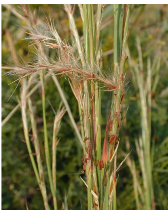
21 Little Bluestem Schizachyrium scoparium

This commonly encountered grass brings a lot of ornamental value to the garden. In the fall the stems turn rusty brown color.