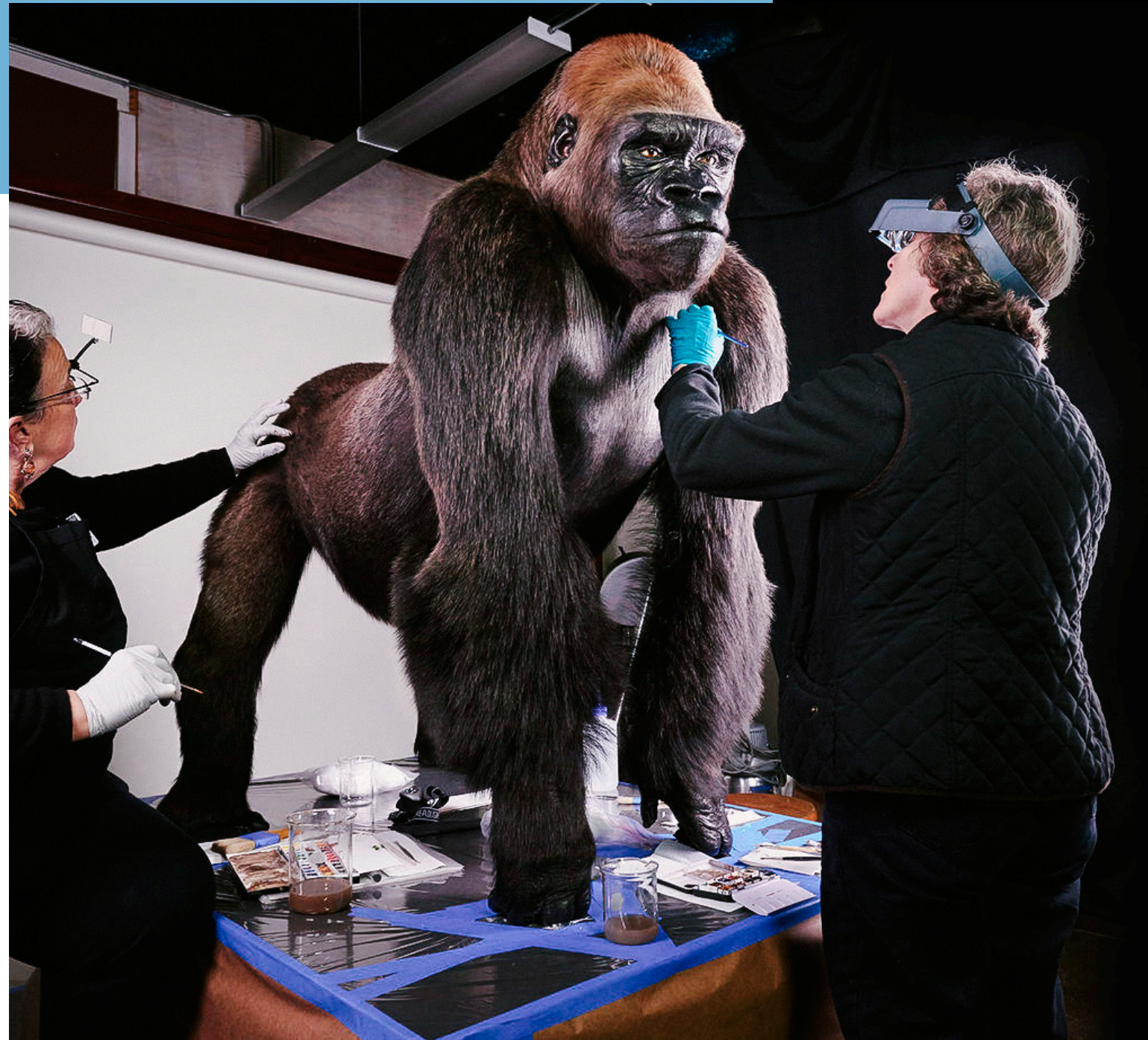
(Right) Bushman, the Gorilla