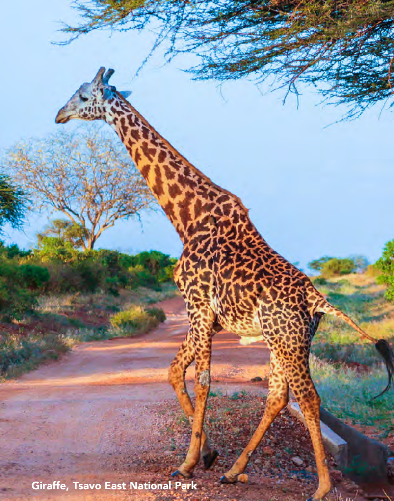
Giraffe, Tsavo East National Park