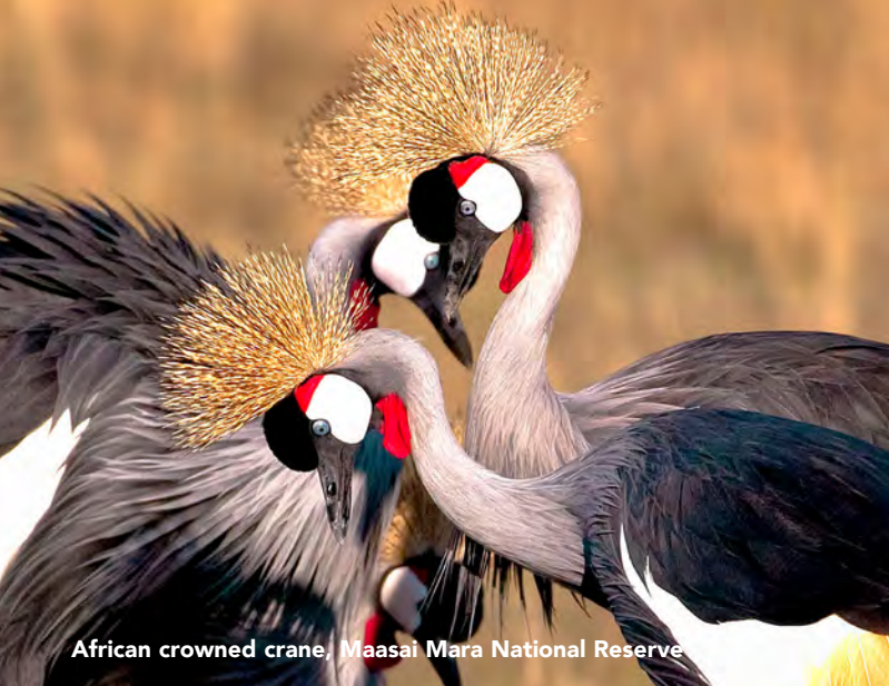
African crowned crane, Maasai Mara National Reserve