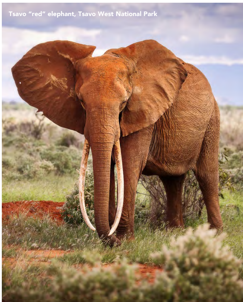
Tsavo "red" elephant, Tsavo West National Park

We then explore the Karen Blixen Museum , the Out of Africa author's former farmhouse, which she called Mbogani ("a house in the woods"). After lunch, enjoy a private visit to the world's most successful program for rescuing and rewilding orphaned elephants and rhinos, the Sheldrick Wildlife Trust .