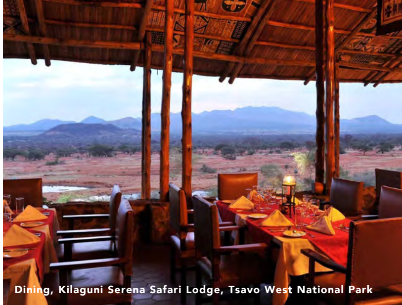
Dining, Kilaguni Serena Safari Lodge, Tsavo West National Park

NOT INCLUDED IN RATE International airfare; passport/visa fees; meals not specified; alcoholic beverages other than what is noted in inclusions; personal items and expenses; airport transfers other than for participants on arrival and departure days; excess baggage; trip insurance; any other items not specifically mentioned as included.