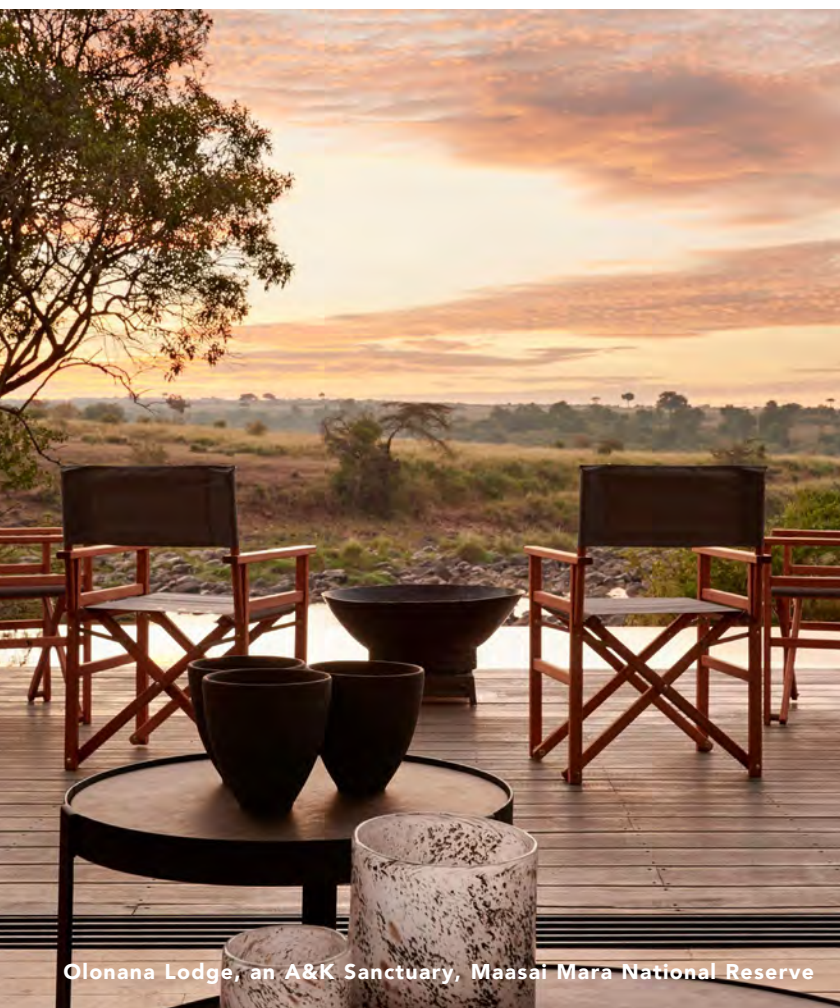
Olonana Lodge, an A&K Sanctuary, Maasai Mara National Reserve

Glass-fronted suites line a quiet stretch of the Mara River, where hippos stir and birds wheel overhead. Drives into the Mara Triangle bring you close to cheetahs, elephants, and seasonal migrations.