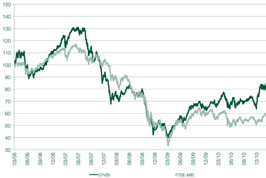
Chart 3 – EYVBI – FTSE MIB (March 2006 – February 2011)

The chart shows that the EYVBI generally followed the market trend, outperforming the FTSE MIB index starting from June 2009, with an overall performance in the last 5 years equal to -16.5% (compared to -0.6% of FTSE MIB).