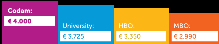
Average starting salary (gross) of software engineers by type of education

Codam graduates earn higher salaries at their first jobs.