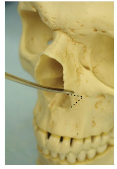
Figure 3 The curved osteotome is seated in the pyriform aperture at its "high" starting point about the head of the inferior turbinate. The wedge of bone that prevents collapse of the lateral nasal wall and inferior turbinate head is known as Webster's triangle .