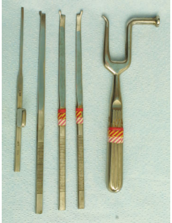
Figure 1 Multiple osteotomes that are used for straightening a crooked nose. From left to right, they are a 2-mm osteotome, Anderson-Neivert straight guarded osteotome, right and left Anderson-Neivert curved guarded osteotomes, and a Rubin nasofrontal osteotome.

effects of the osteotomy on the patient's nasal airway. Using acoustic rhinometry (AR), Grymer et al have shown that lateral osteotomies severely limit the nasal valve area.<sup>9</sup>