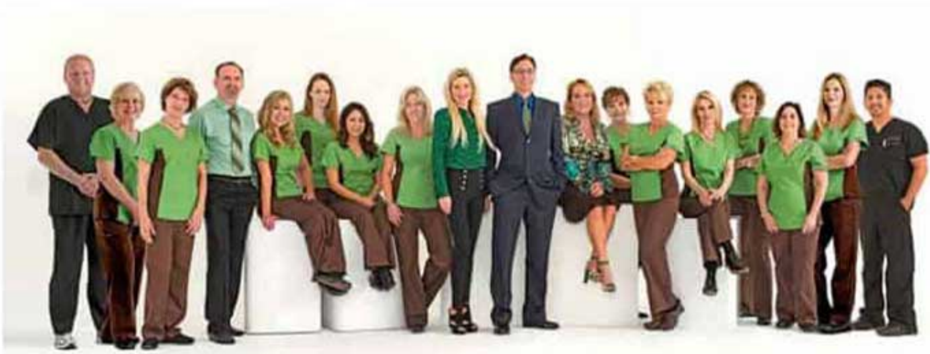
TAYLOR SHERRILL & ASSOCIATES

GROUNDBREAKING NEW DEVELOPMENTS IN SKIN CANCER TREATMENTS, FAT REMOVAL, AND FACELIFTS — ALL WITHOUT SURGERY | By Matt Link