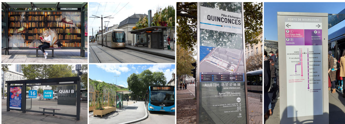
Nancy: augmented signage and temporary decoration to highlight Book Week.

of passengers use transport stops as a source of information to help them plan or follow their route