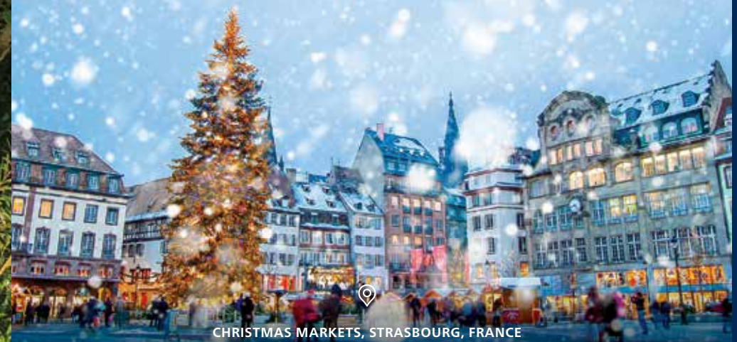
CHRISTMAS MARKETS, STRASBOURG, FRANCE