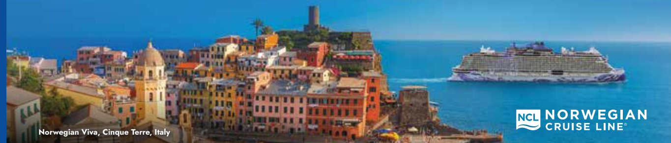
Norwegian Viva, Cinque Terre, Italy