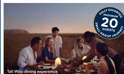
Tali Wiru dining experience