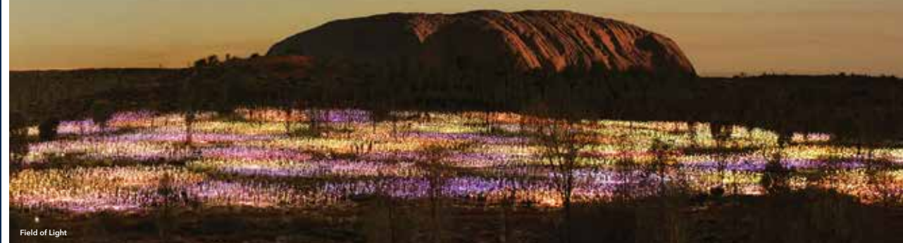
Field of Light