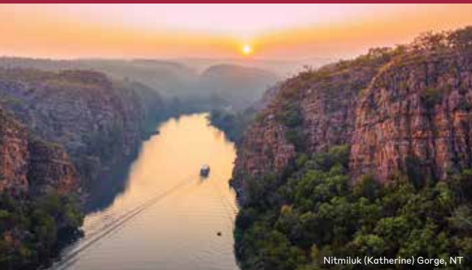
Nitmiluk (Katherine) Gorge, NT