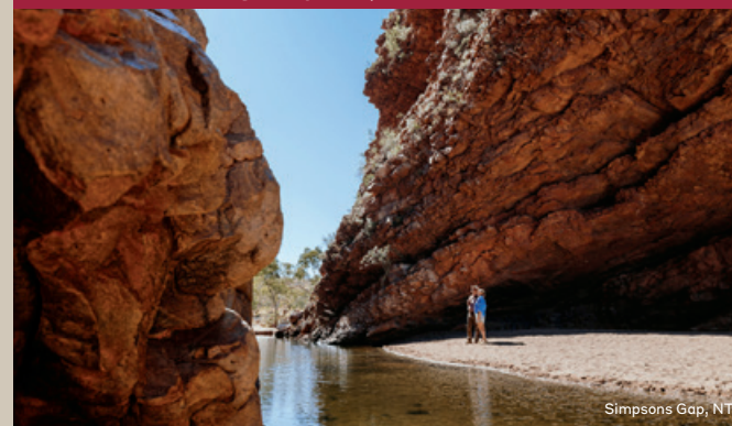
Simpsons Gap, NT