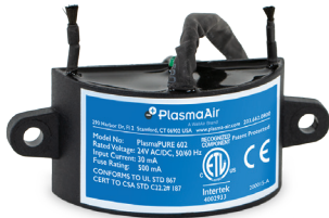
PlasmaPURE 600 Series

The Plasma Air HVAC products fit seamlessly into a home’s existing or new HVAC system for continuous whole-home air purification. From small to large residences, there is a solution to fit your needs. The Plasma Air 600 Series provides safe and continuous air purification to the entire indoor environment using patented brush-style bipolar ionization technology. The units are inconspicuous and require little maintenance. “The cost effectiveness was the key to putting one in every home,”