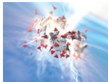
Cell bursts due to osmotic pressure