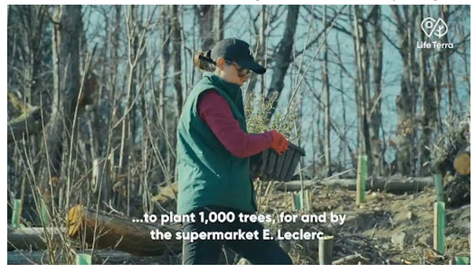
EY and Life Terra plant almost 1,200 trees in one day

EURACTIV Mail - 🌔 Life Terra Newsletter - May 2023 🧶