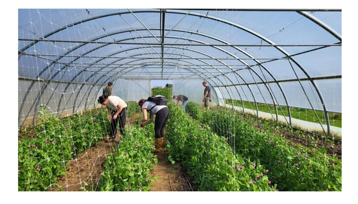
ChangeNOW Conference in Paris

You can now see more information on monitoring and the trees' survival rate in each event page. Find some examples <u>here</u> and <u>here</u>.