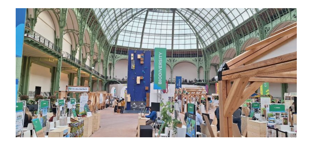
New Life Terra Video