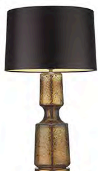
Antero Amber Smoke