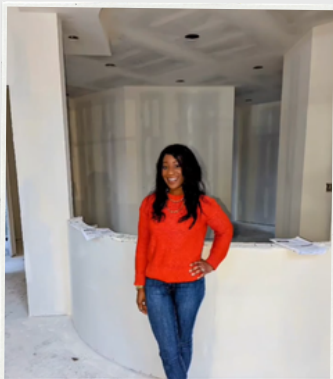
Where it all began