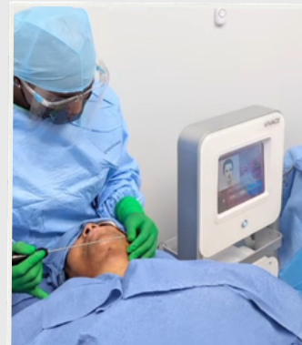
Led by surgical expertise