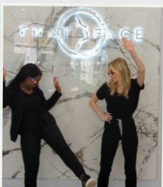
Fun & Positive Energy