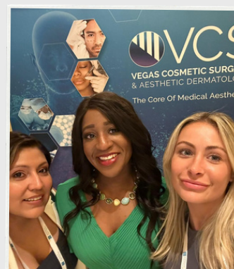
Always learning, always evolving