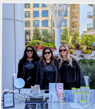
Community moments we love