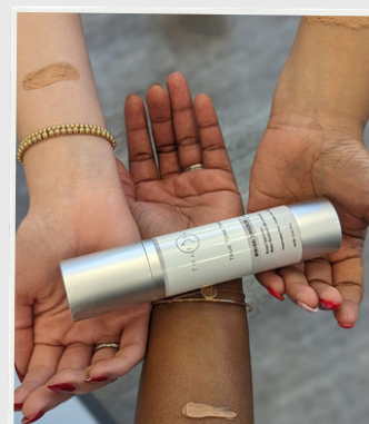
Skincare that supports your results