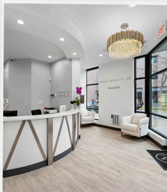
Designed with intention