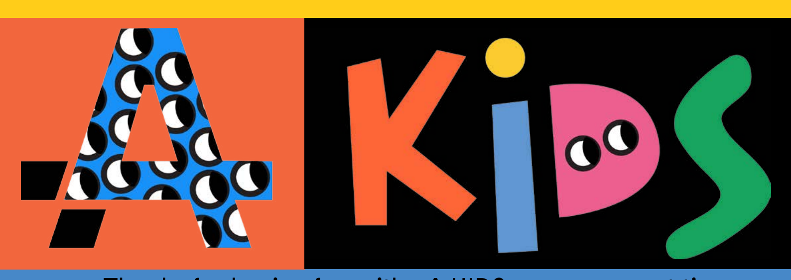
Thanks for having fun with 4A KIDS – see you next time 4a.com.au