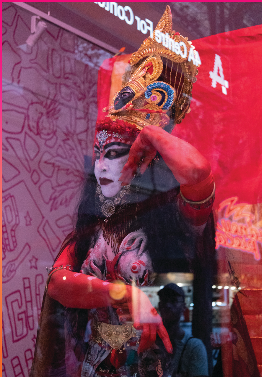
Rakini Devi, Urban Kali , 2022, performance documentation, 4A Centre for Contemporary Asian Art

181–187 Hay Street Haymarket Warrane/Sydney NSW 2000 Australia