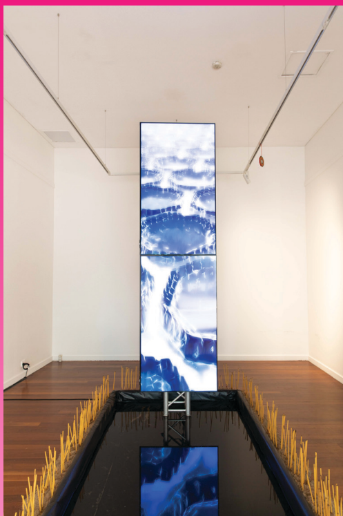
Rel Pham, Cache , installation view, 2022