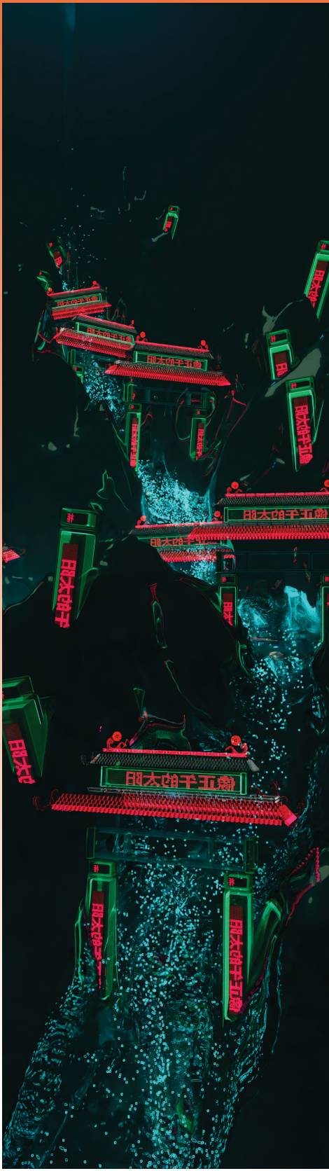
Rel Pham, Cache (still), 2022, two-channel video. Courtesy the artist