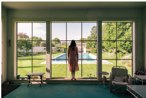
Pia Johnson, Holding Still, from Mooramong Green series 2020, Archival inkjet print

4A Papers is a digital publication managed by 4A Centre for Contemporary Asian Art. Established in 2016, the 11th issue on 'intimacy' is now out.