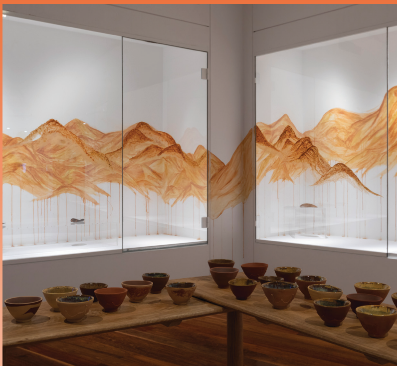
Drawn by stones , exhibition view; photo: Silversalt for Drawn by stones, presented by 4A Centre for Contemporary Asian Art at Wollongong Art Gallery, 2022