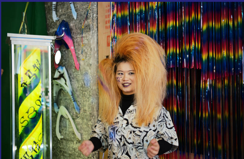
Ye Funa, The Smart Gallery [杀马特发廊] , 2021, Installation view, Exhibitionist, Smart Master, C5CNM, Beijing