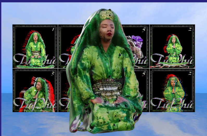
Tung Monkey, Four Palaces , 2021 (NFT), featured on 4A+, designer Melanie Huang, 2023