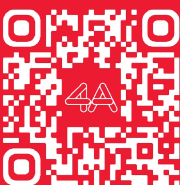
Visit our website for full artwork captions and acknowledgements.

Follow us for updates on 4A's late-night programming!