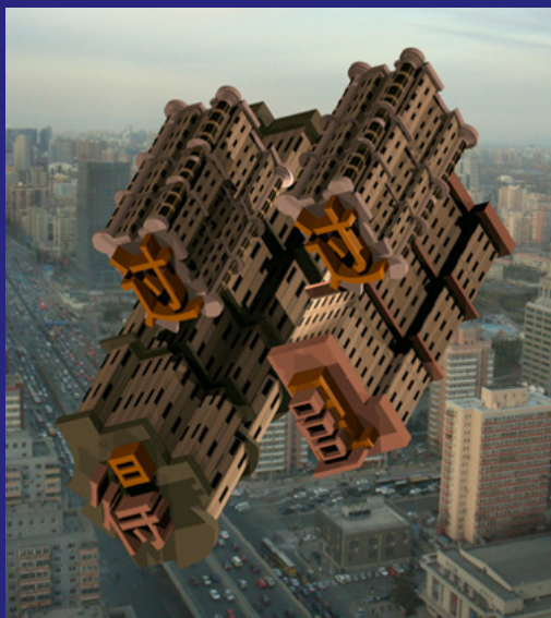
Laurens Tan, De Guo Qie Guo (Whatever: Blindly Following a Path) , 2009, signed Edition of 8

By dissolving the physical boundaries between the white cube (or black box) and immersive, programmable 3D spaces, 4A recontextualises emergent digital art in a project embracing the creative endlessness of NUWORLD.