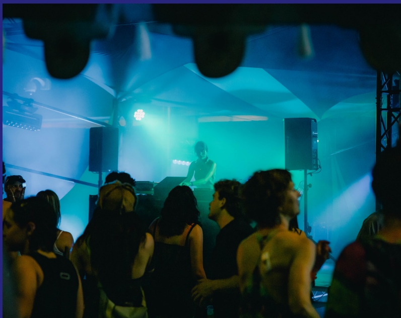
SUCHI, CLUB 4A, Hermann's Bar, University of Sydney, 2023.

4A will continue to present some of Australia's leading producers, DJs, performances and visual artists from the Asian diaspora.