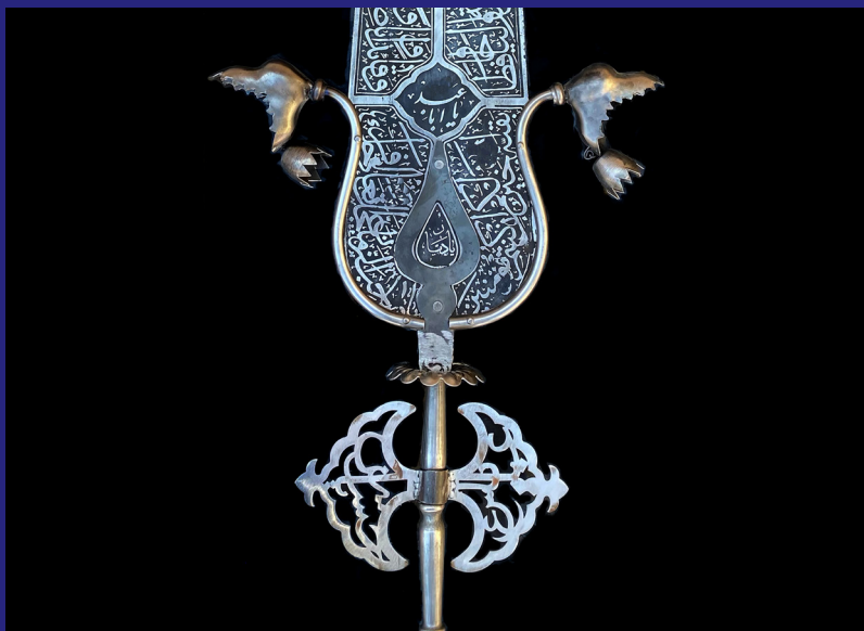
Elyas Alavi, from the ALAM series, 2023 (detail of work in progress)