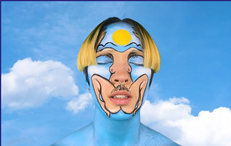
Sin Wai Kin, The One (still) , 2021, single channel video.

The artists in YEAR OF THE DRAGON [龙年] present glimpses into a reality beyond our own, remaking traditional tales of benevolence and enlightenment through contemporary art practice.