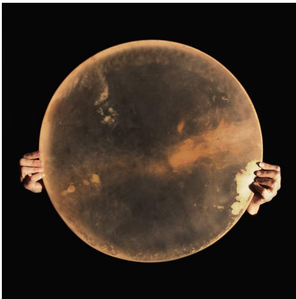
Nasim Nasr, Muteness #1 (2011), digital print, 80 x 80 cm.

4A is pleased to present dual solo exhibitions featuring new and commissioned work by two exciting artists, Indonesian-Australian Tintin Wulia and Iranian-born Nasim Nasr .