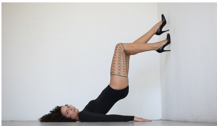
Left: Robert McDougall, Hotel Windsor Study #2 (Triptych), 2013, HD video installation, sound, dimensions variable, 9:50 mins. Courtesy the artist. Right: Angela Tiatia, Walking the Wall (still) 2014, single-channel digital video, 13:05 mins. Courtesy the Artist and Alcaston Gallery, Melbourne.

The artists are available for interview and photo opportunities.