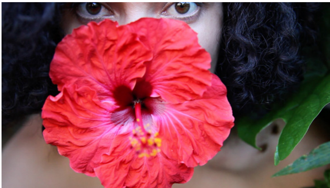
Angela Tiatia, Hibiscus Rosa Sinesis (still), 2010, single-channel digital video, 1:30 mins.