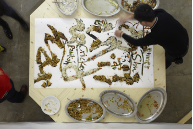
Left: Chinese Garden of Friendship, Darling Harbour. Right: Yangjiang Group, After Dinner Shu Fa at Cricket Pavilion, 2012, Eastside Projects and Grizedale Arts, Birmingham.