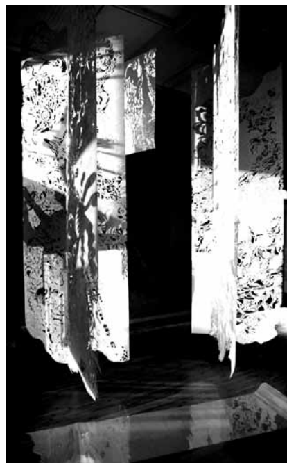
Tianli Zu, White Shadows (2013), (detail) acrylic on acetate film, handcut, and light projection and animation dimensions variable.