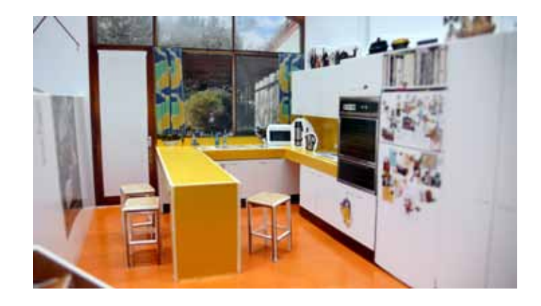
LEFT: Melissa Howe, Sectional Model 1 - Entry detail (2010) Archival pigment print and cardboard. Courtesy of the artist. Photography: Torunn Higgins

RIGHT: Melissa Howe, Sectional Model 1 - Kitchen defail (2010) Archival pigment print and cardboard. Courtesy of the artist. Photography: Torunn Higgins