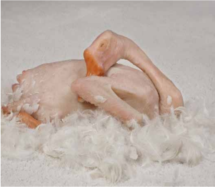
IMAGE: Shen Shaomin, I sleep on top of myself, 2011, (detail of production image), silica gel simulation, dimensions variable. Courtesy the artist