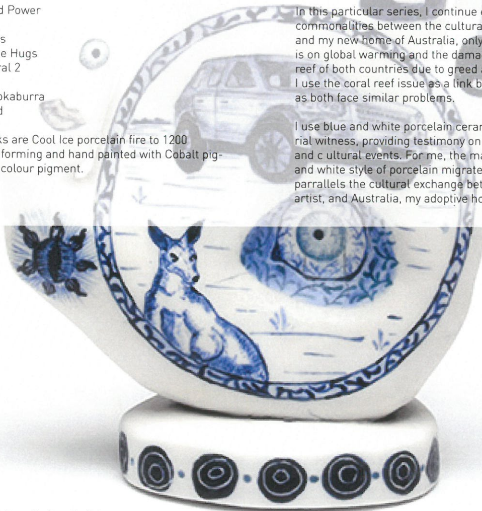
Image captions: Vipoo Srivilasa, Car from the Fortune Teller series, 2007, Cool Ice porcelain fire to 1200 degrees, hand forming and hand painted with Cobalt pigment, ceramic colour pigment

I use blue and white porcelain ceramic as a kind of material witness, providing testimony on key historical, artistic and cultural events. For me, the manner in which the blue and white style of porcelain migrated from Asia to Europe parallels the cultural exchange between myself, as a Thai artist, and Australia, my adoptive home.