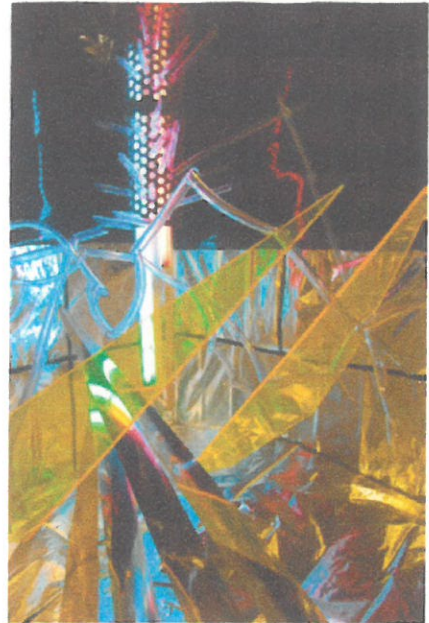
Images: (top-left) Jumaadi, untitled (detail), 2008, wax pencil on paper, Photo: courtesy the artist and Legge Gallery; (above and top-right) Soo-joo Yoo, So this is fxxking, beautiful our future..? , Lights, vinyl, foils, clear tubes, wire, aluminium pipes, rubber mats, various media

OPENING Friday 1 August at 6pm with a special story-telling performance by JUMAADI ARTIST FLOORTALKS: Saturday 16 August at 2pm