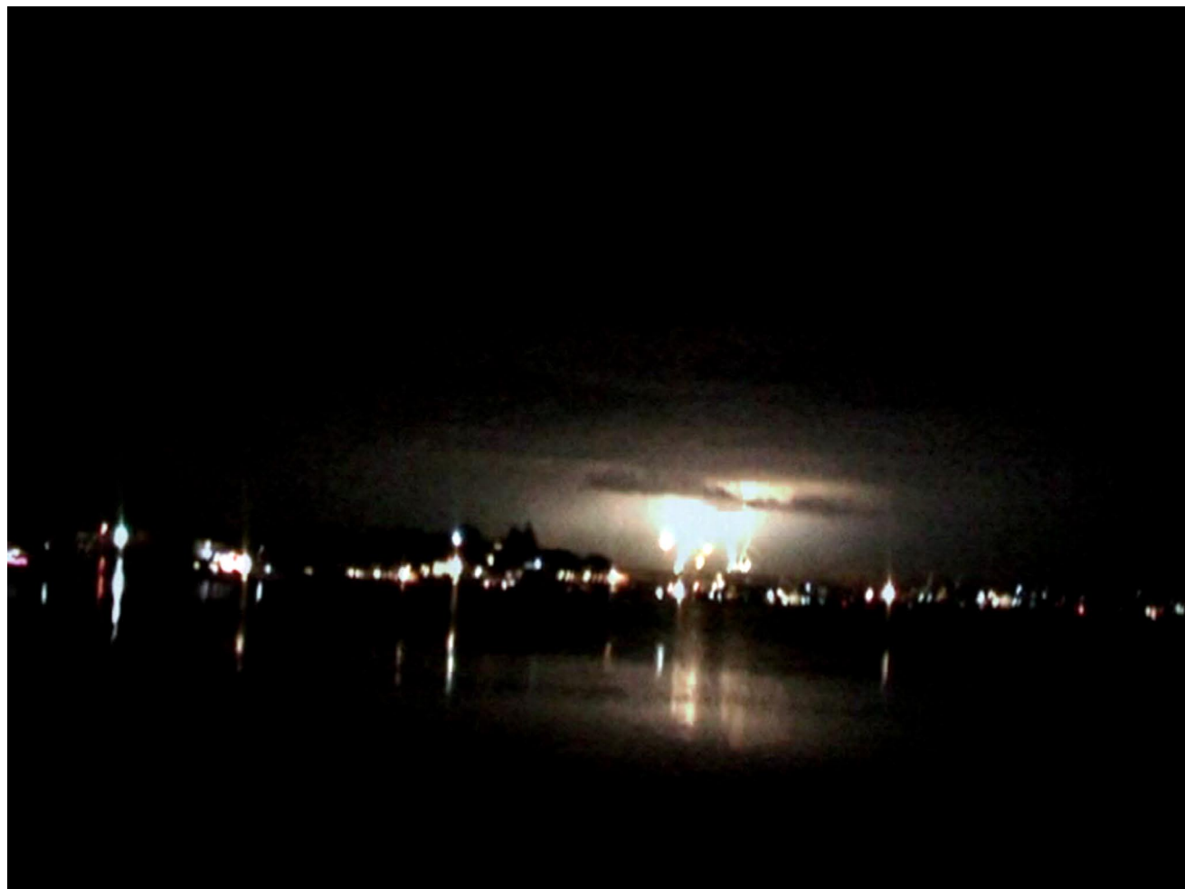
Top: Australians (2006/2009), still from digital video