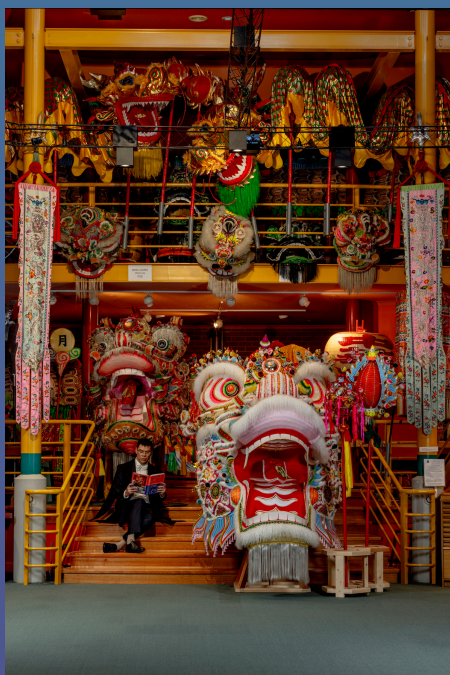
Christian Thompson, House of Gold Chapter 12, 2024.