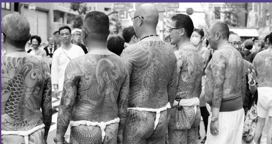
Sly Morikawa, Devotion , 2024.

Presenting new and existing works, this survey exhibition demonstrates the breadth of Morikawa's sophisticated explorations of society's underground – the taboo, outcast or forgotten. With a lithe sensitivity, her recognisable style balances ideas of desire, power and agency. They evoke an effortless dreamlike quality in which personal and social biases are suspended for a brief moment, allowing viewers to process the often uncomfortable realities of everyday life.