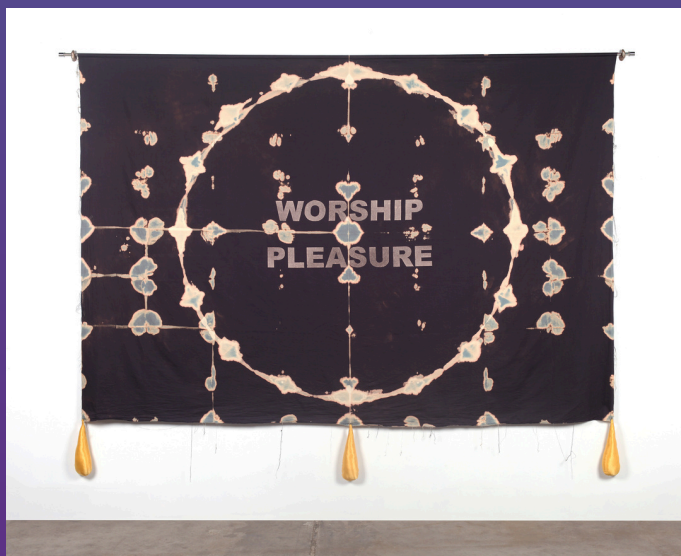
Owen Leong, WORSHIP PLEASURE , 2024, cotton, bleach, silk, steel, bronze finger hooks

Throughout the exhibition, events and performances activate the space, celebrating diversity and the power of wisdom and creativity to help us shed our skins and begin the year anew.