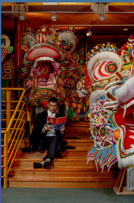
Christian Thompson, House of Gold Chapter 12, 2024.