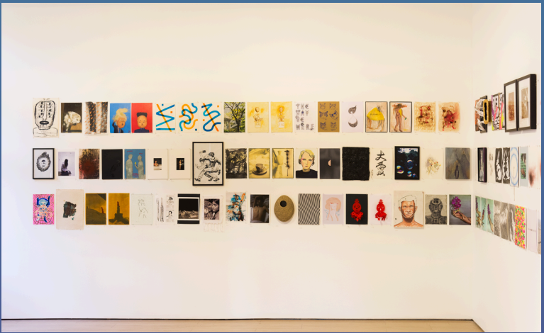
4A A4, 2019, 4A Centre for Contemporary Asian Art