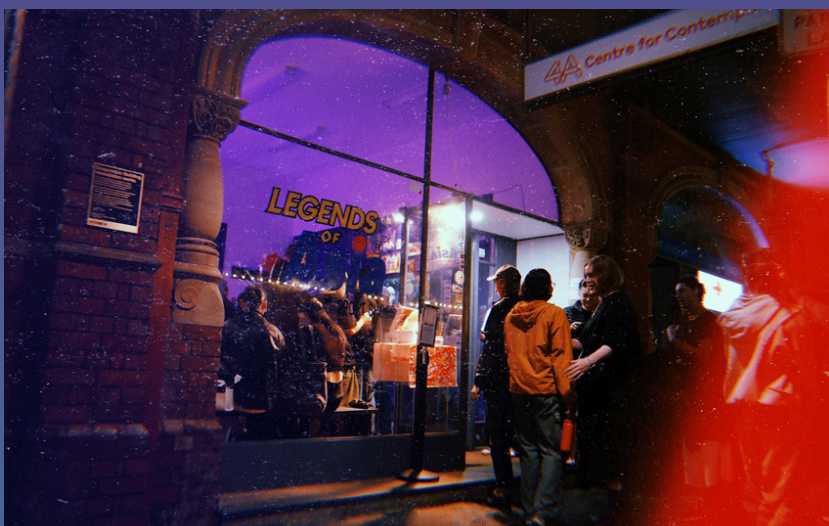
LEGEND OF ASIA® SPORT SHOES (opening day celebrations), 2024; Photo: Ankit Mishra

The Emerging Artists Program '25 focuses on the national art ecology by providing snapshots of the future of contemporary art in Australia and supporting next generation creatives.