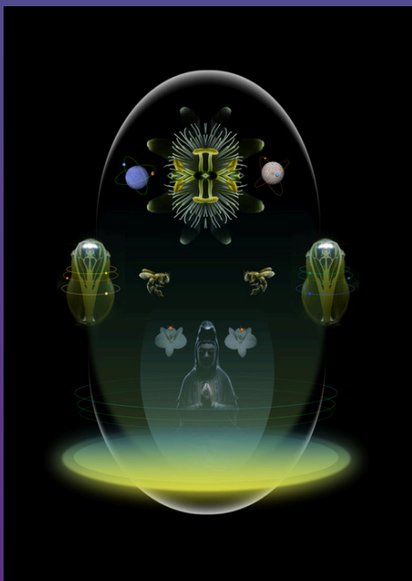
Man&Wah, Kwan Yin - Mind/Matter, 2024 .

By transforming 4A into an immersive cosmic environment, the exhibition invites meditation on growth, nature and possible futures, highlighting deep connections between plants and the cosmos.