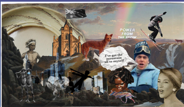
Peter Waples-Crowe, Ngaya (I Am) (still), 2022; single-channel video installation. Commissioned by ACMI. Courtesy of the artist © Peter Waples-Crowe and ACMI

Hosted at Kala Kulo (Kathmandu) in April, and Arts House (Naarm), and 4A (Eora) in October, the exchange will culminate in a symposium and a digital publication curated by ten Buuren and the Kala Kulo initiative, exploring Indigenous Futurism.