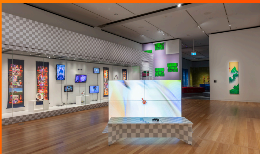
Infinite Scroll 荧屏沉溺 exhibition view, 2025, Chau Chak Wing Museum, the University of Sydney.

Themes of digital identity are explored through participatory works that remix meme culture. Gamified artworks critique the commodification of artists and the spectacle of global art markets, while others invoke the handscroll as a counter to digital acceleration.