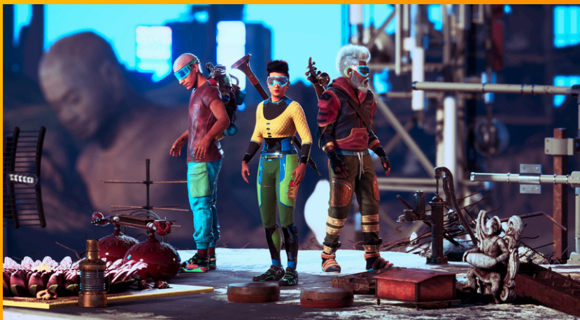
Elsewhere in India, process image, 2024. Courtesy the artists.