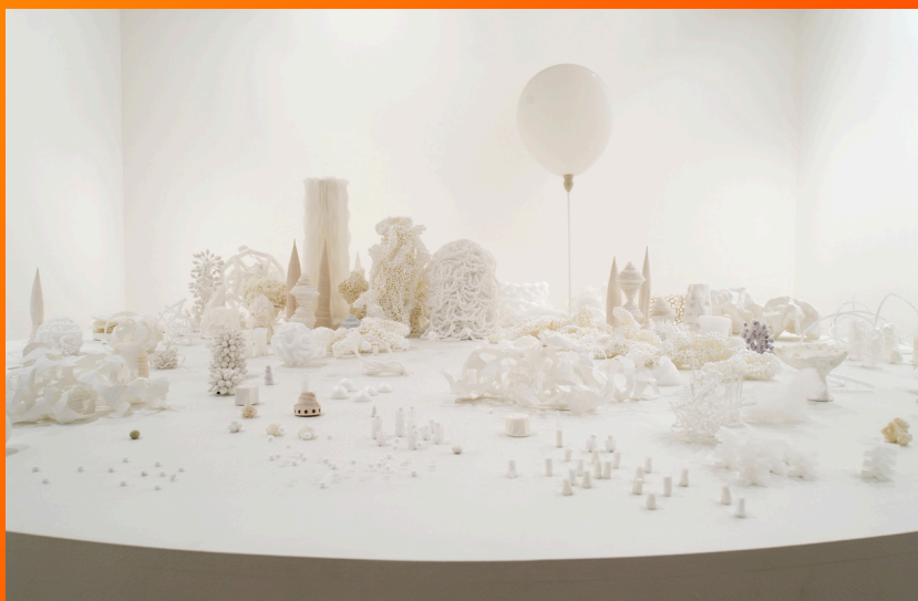
Koji Ryui, Untitled (material explorations in white) , mixed media, found objects, 2006.

A publication will launch alongside the exhibition, featuring newly commissioned essays, archival material and artist reflections that expand on the themes of the show and chart 4A's evolving contribution to contemporary art and cultural discourse in Australia and beyond.