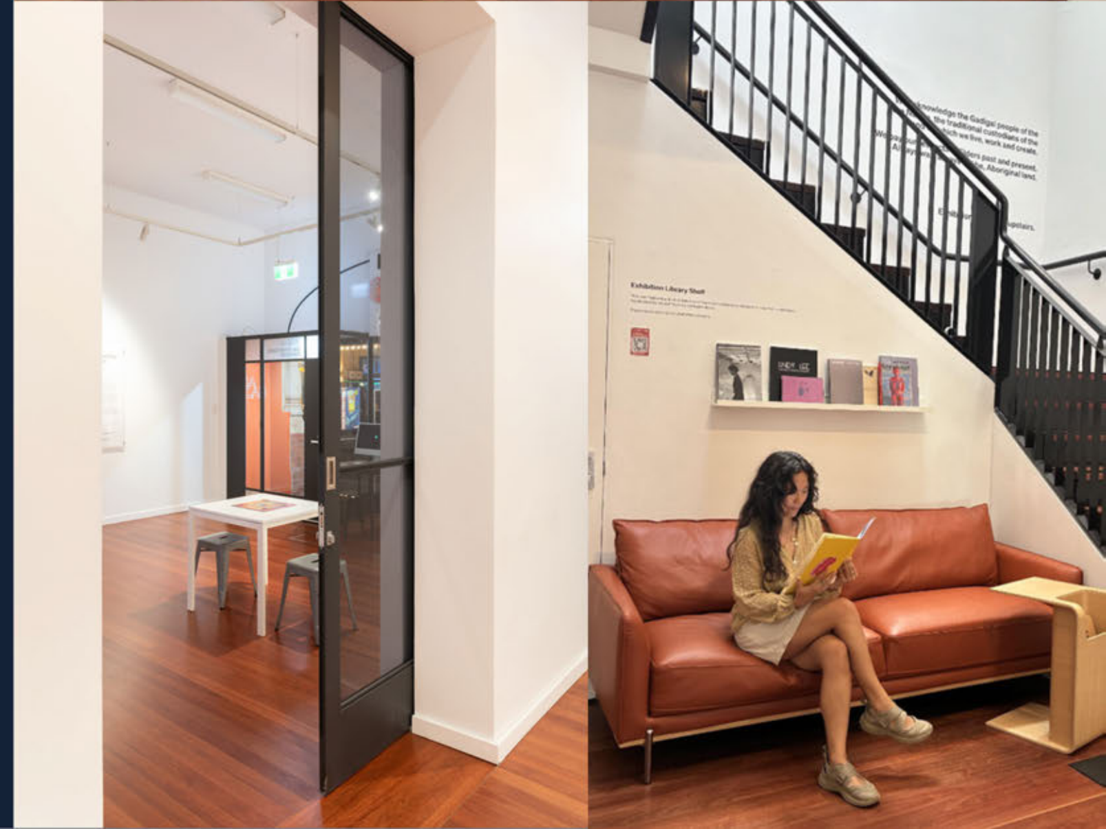
Top & bottom image: 4A and 4A LAB post-renovation, 2025.