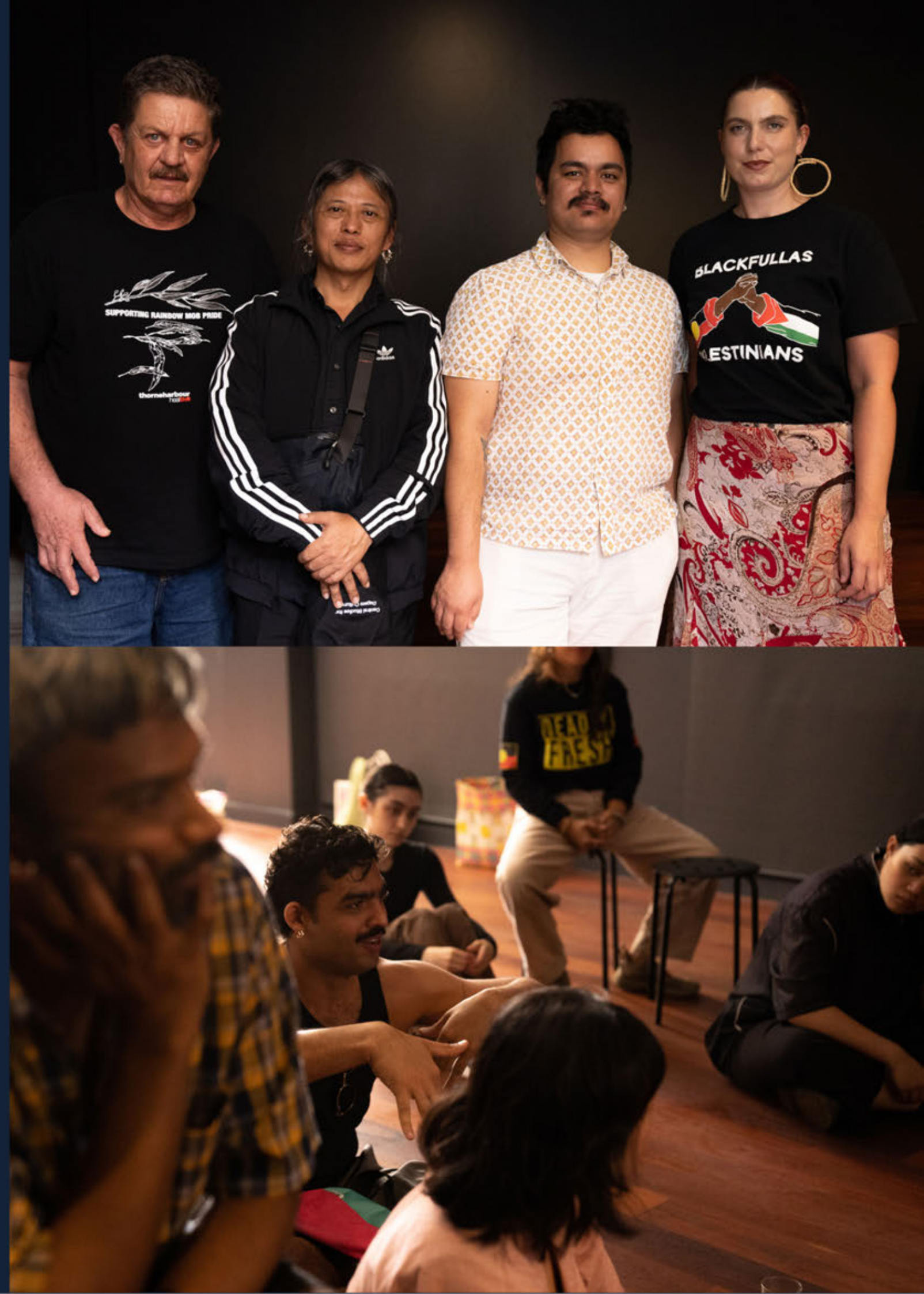
Top & bottom image: High Altitude Exchange International Residency Symposium, 2025.