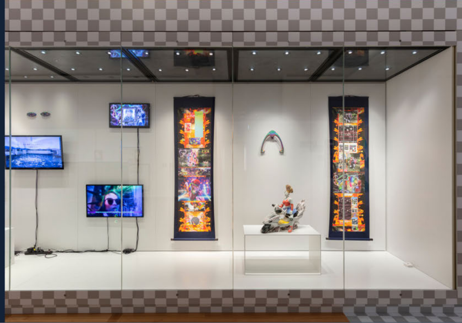
Top & bottom image: Infinite Scroll 荧屏沉溺 exhibition view, 2025, Chau Chak Wing Museum.