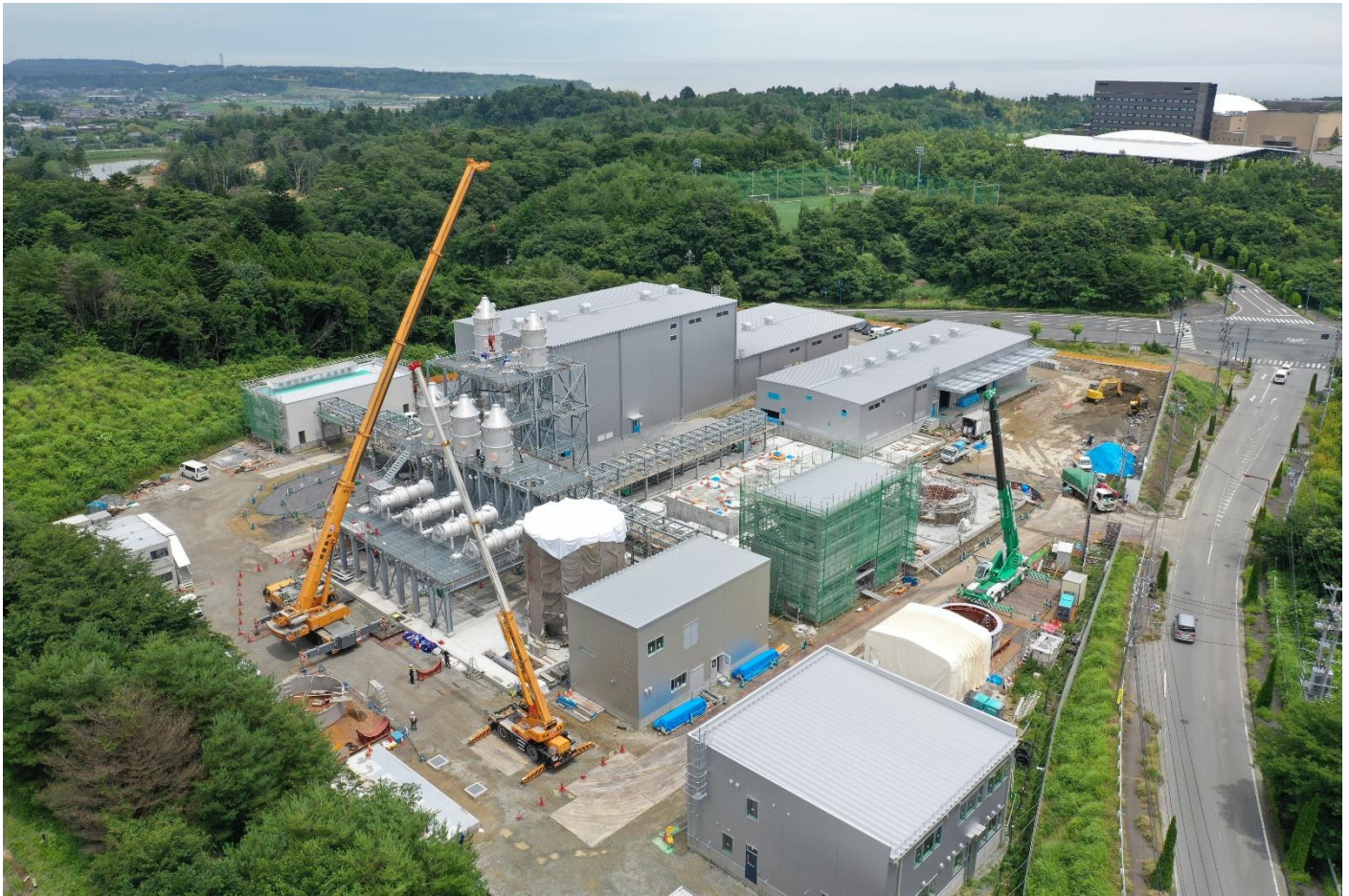
Aerial view of the Naraha Lithium Hydroxide Plant construction site

As at 30 June, approximately US$40 million has been spent on engineering, civil works, electrical, instrumentation, fabrication and procurement at the Naraha Plant. Site operations have continued throughout the period, however equipment deliveries from overseas are expected to be delayed due to COVID-19 which is currently projected to delay final project completion by approximately two months.