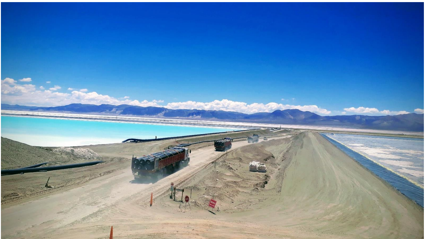
Gathering network construction activity

Work during the June quarter has focussed on the key areas of brine gathering networks, gathering ponds and main evaporation ponds.