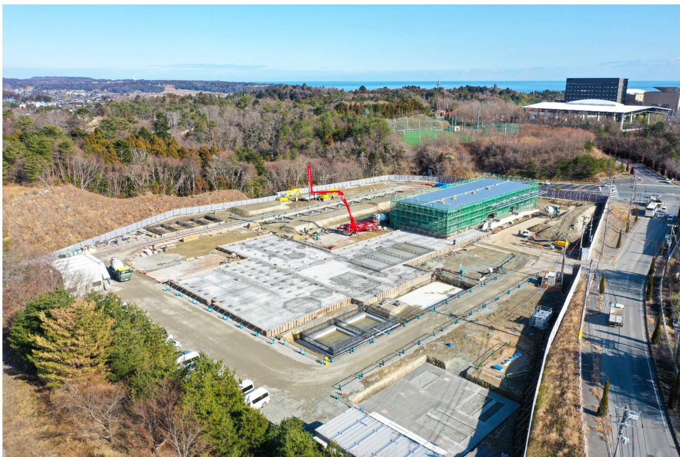
Aerial view of the Naraha Lithium Hydroxide Plant construction site

Discussions are ongoing with the Veolia Joint Venture's plant design engineers with the objective of minimising any impurity sources from plant feed and raw materials entering the plant.