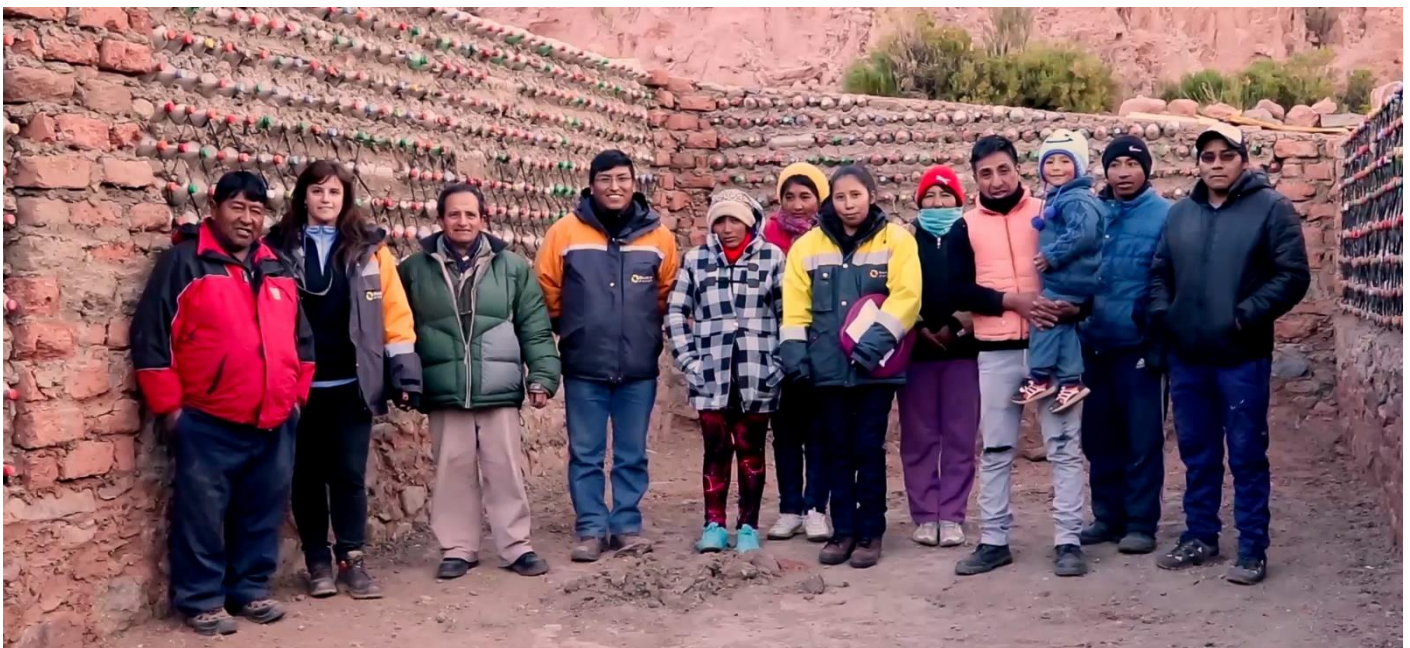
Sales de Jujuy's Shared Value Team pictured with local community members as part of the 'Raising Recycled Walls' Project

During the December quarter the Shared Value Team conducted a series of workshops in Olaroz to develop local furniture construction capabilities, using recycled wooden pallets sourced from the Olaroz Lithium Facility. The workshops lasted several days with over 25 items of furniture (including tables, chairs, benches and bookshelves) being constructed. The furniture will be used by local businesses and in the local schools, health centre and police station.