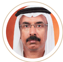
HE Mohamed Al Murr

HE Abdulrahman Al Owais (UAE, 1967) is a Cabinet Member and Minister of Health and Prevention and Minister of State for Federal National Council Affairs. He joined the federal Government in 2006 as the Minister of Culture, Youth and Community Development. Chairman of the Dubai Culture and Arts Authority, he is a Board Member of Dubai Healthcare City, the Chairman of the Board of Trustees of Hamdan bin Mohammed bin Rashid Al Maktoum International Photography Award, Member of the Board of Trustees for the Sheikh Hamdan Bin Rashid Al Maktoum Awards for Medical Sciences, Member of the Board of Directors of the Emirates Foundation for Philanthropy and a Member of the Board of Trustees of Sultan Bin Ali Al Owais Cultural Foundation since 1992. He is also the 1st Vice President of the UAE National Olympic Committee.