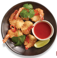
plu 103 ebi katsu