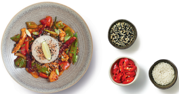
plu 87 firecracker chicken

turn up the heat! try our new hot katsu sauce