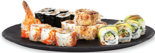
273 - waga set 3