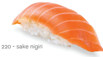
220 - sake nigiri