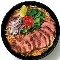
plu 24 chilli steak ramen