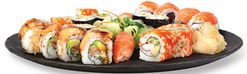
271 - waga set 2