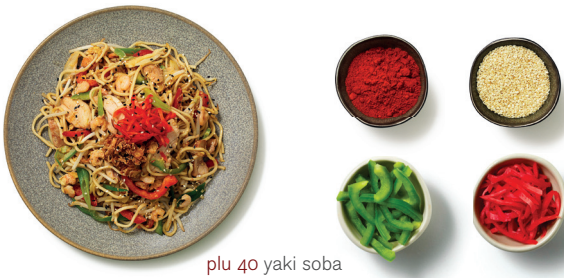
plu 40 yaki soba

soba/ramen noodles | thin, wheat egg noodles rice noodles | flat, thin noodles without egg or wheat