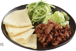
plu 112 duck wraps