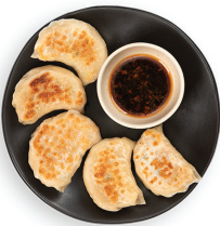
plu 100 chicken gyoza