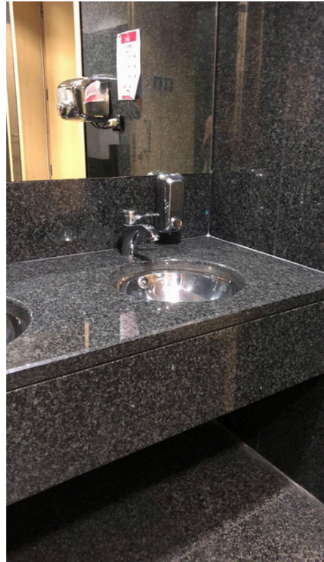
Overview of the restrooms (exterior)