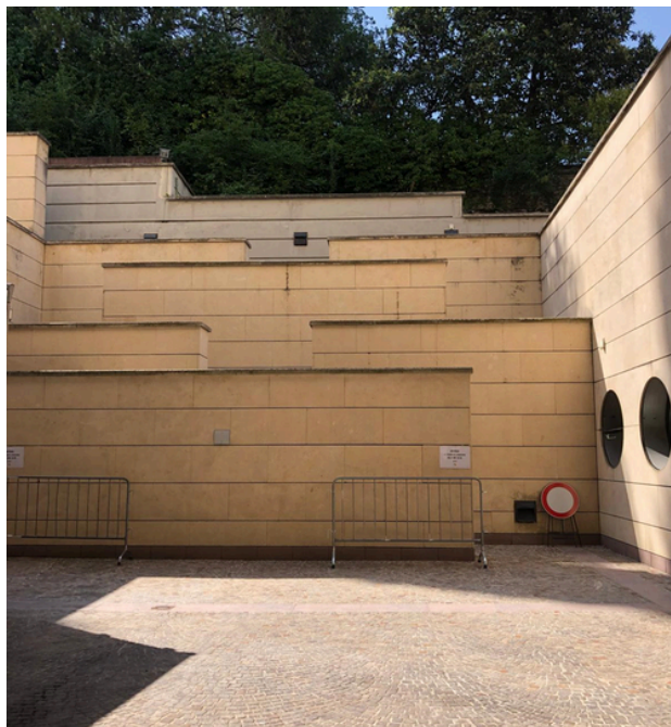
Overview of the terrace entrance