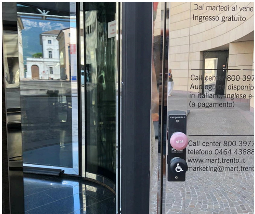
Revolving door that can be slowed down