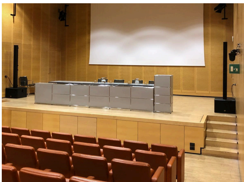
Stage of the Conference Room (with 5 steps)