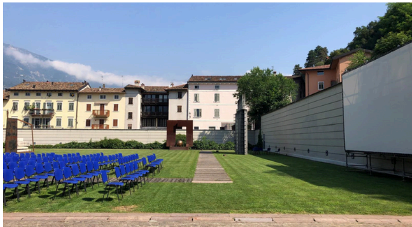
Overview of the garden