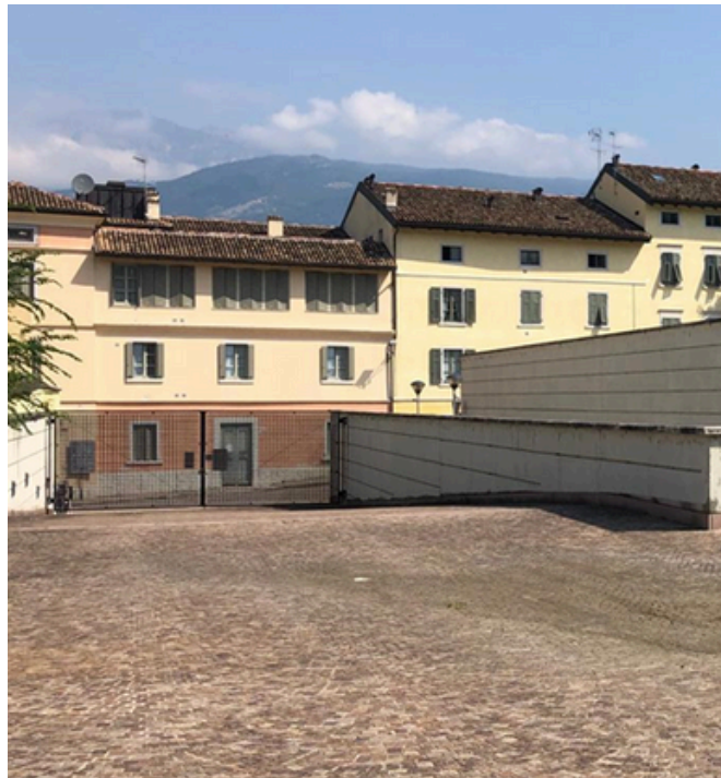
Garden entrance for wheelchair users, with a gate (on the left) leading to Via Sticcotta