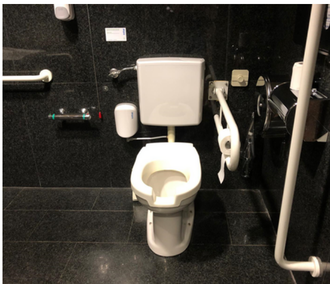
Detail of the accessible restroom for individuals with disabilities