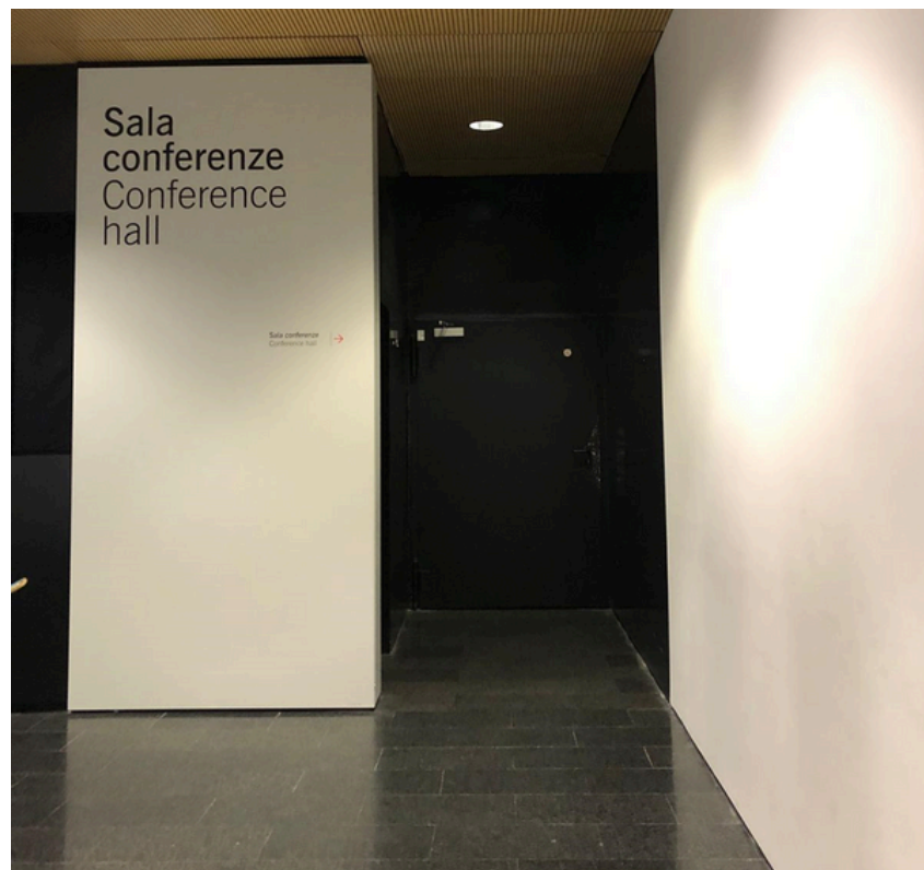
Door to the Conference Room