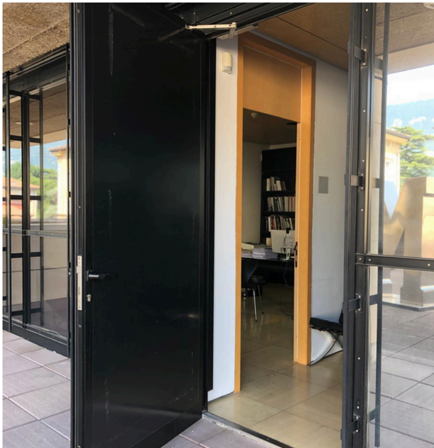
Access door to the terrace for wheelchair users