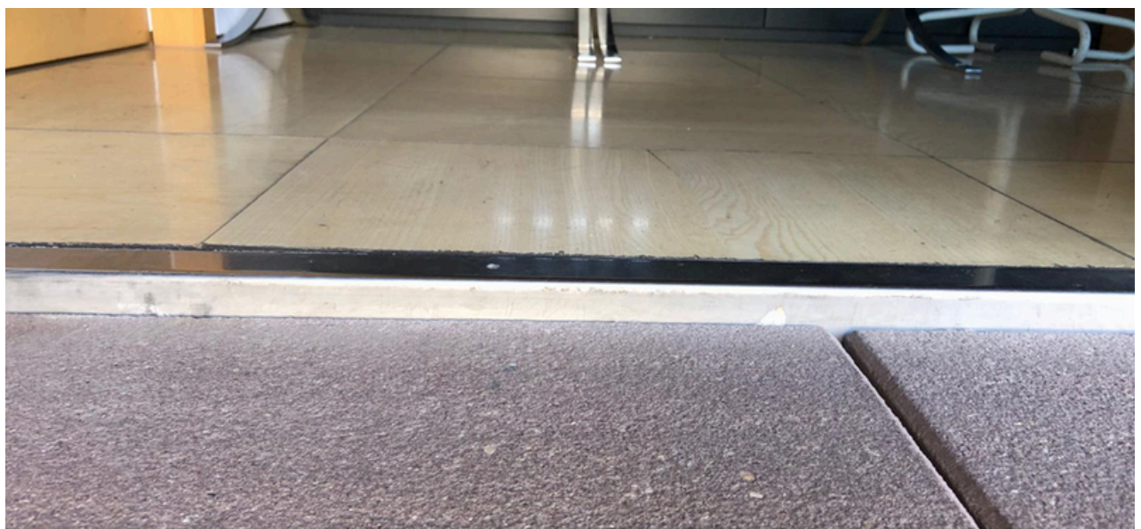
Step at the door (3 cm)