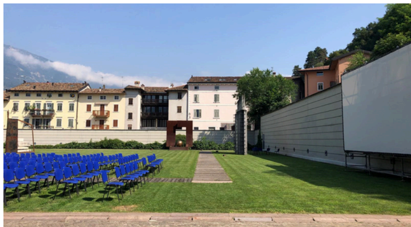
Overview of the garden