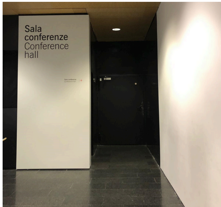
Door to the Conference Room