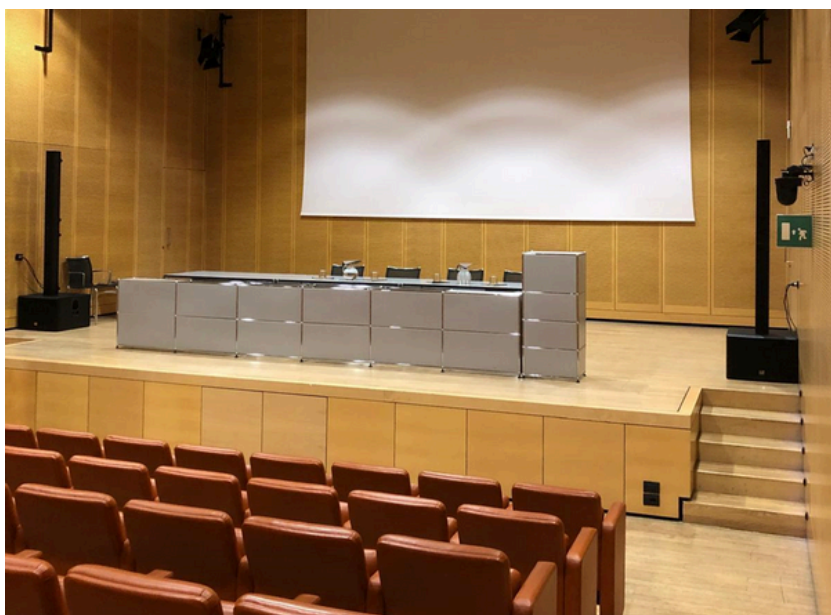
Stage of the Conference Room (with 5 steps)