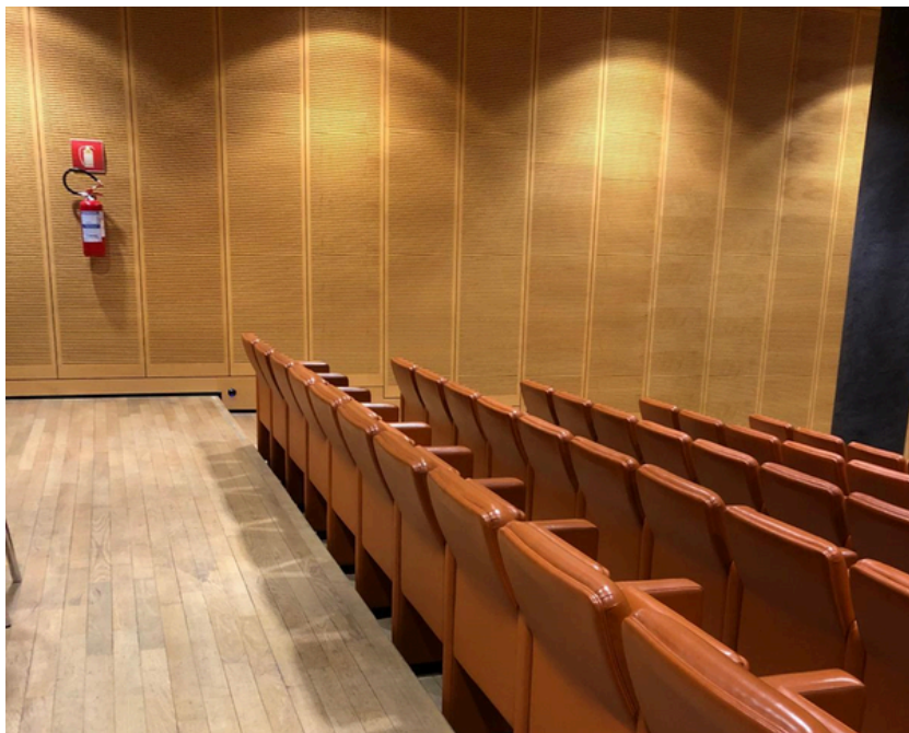
Overview of wheelchair seating in the Conference Room