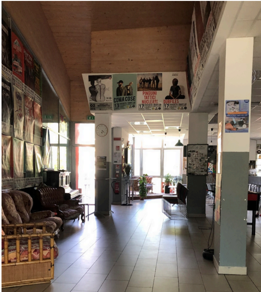
Overview of the hall from the main entrance. Theater room located on the left