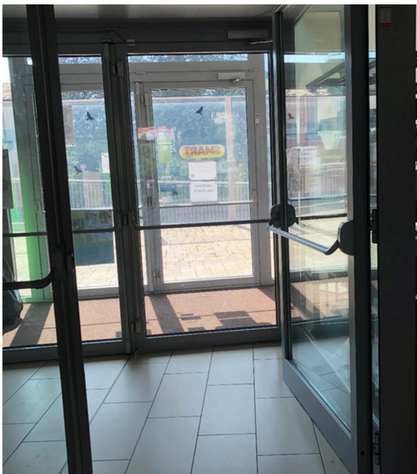
Internal overview of the main entrance