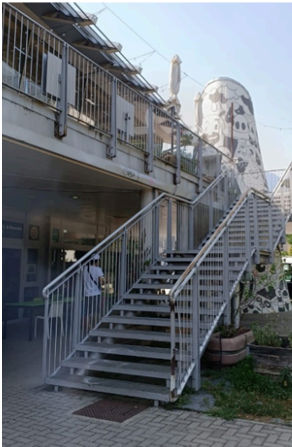
Entrance from the back with 24 steps