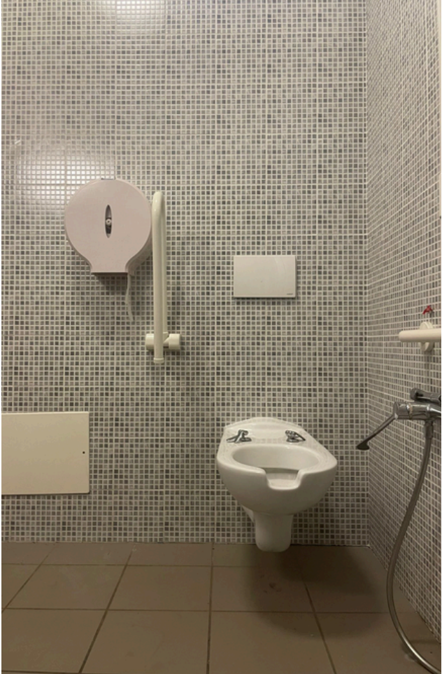
Overview of the restrooms (interior)