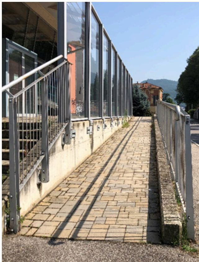
Ramp at the main entrance