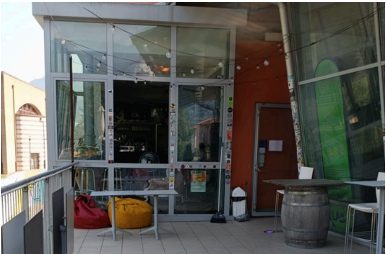
Entrance from the back