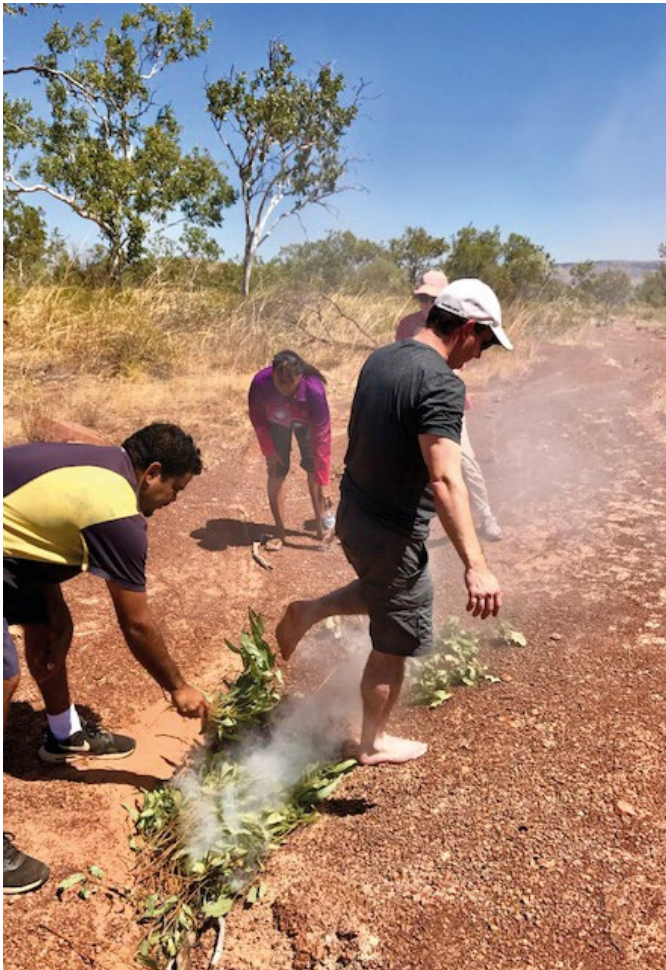
KA Directors and staff participating in a smoking ceremony in WA.