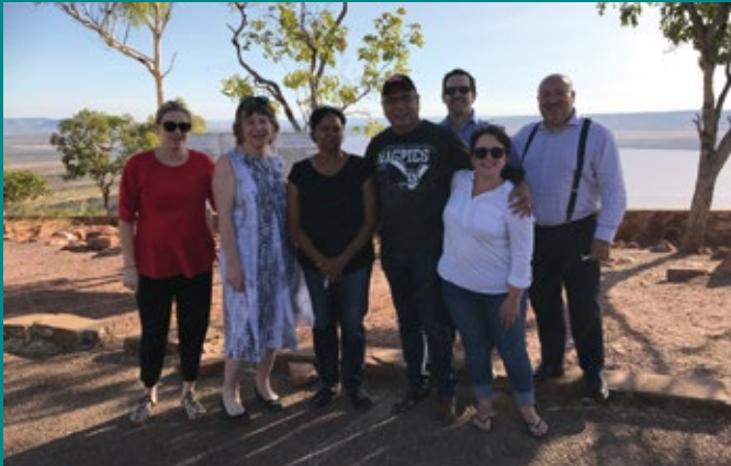
Key Assets EKIM Team pictured with Warren Mundine in Wyndham.