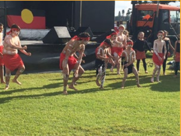
KA NSW participating in NAIDOC Week Celebrations.