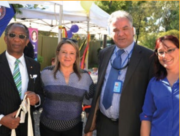
KA SA staff participating in National Reconciliation Week celebrations.