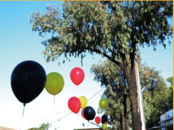
KA QLD RAP event in Dreamworld.