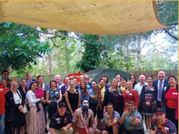
KA QLD RAP event in Dreamworld.