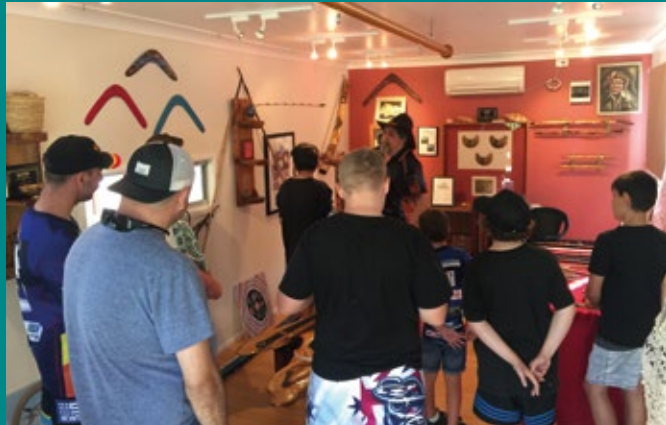
KA QLD camp with Gallang Place.