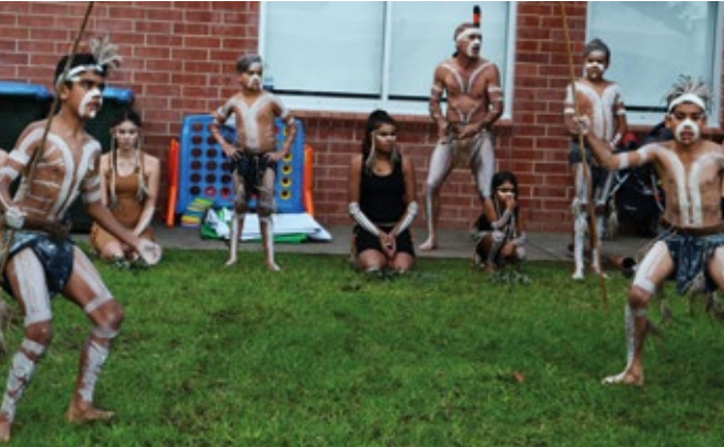
KA SA National Reconciliation Week.