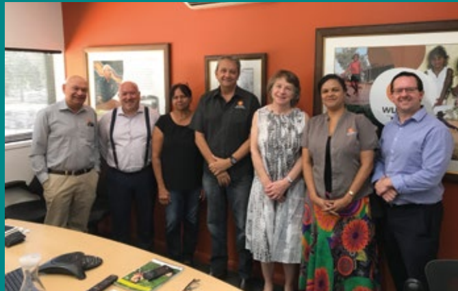
The Key Assets Directors meeting with our partner Wunan in the EKIM.