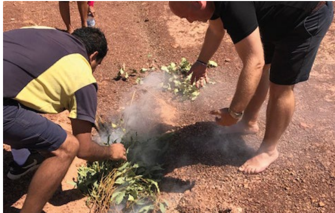
KA Directors and staff participating in a smoking ceremony in WA.