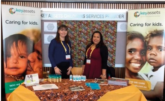
KA staff at the SNAICC Conference.