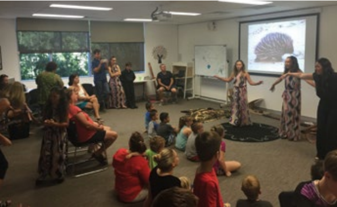
KA QLD Aboriginal and Torres Strait Islander children’s day.

We have progressed through our previous RAP and have learnt from our achievements and challenges. Some of the important learning and changes have been through our consistent participation in Aboriginal and Torres Strait Islander events and activities. We are gradually developing strong partnerships and relationships with Peak bodies and Aboriginal and Torres Strait Islander led and run community organisations. To show our respect, we have made it a point to engage in an acknowledgement of country in our meetings. We have also encouraged our staff to complete a module called Share our Pride as part of their induction; have successfully reviewed our HR policies and have begun partnering with Indigenous recruitment agencies; we are striving to ensure that the Aboriginal and Torres Strait Islander children in our care maintain a connection with their culture, communities and country by making sure that their care plans are culturally appropriate. We have learnt that trust is key in achieving success on our reconciliation journey and we will continue striving to earn it and ensure that our actions are culturally appropriate.