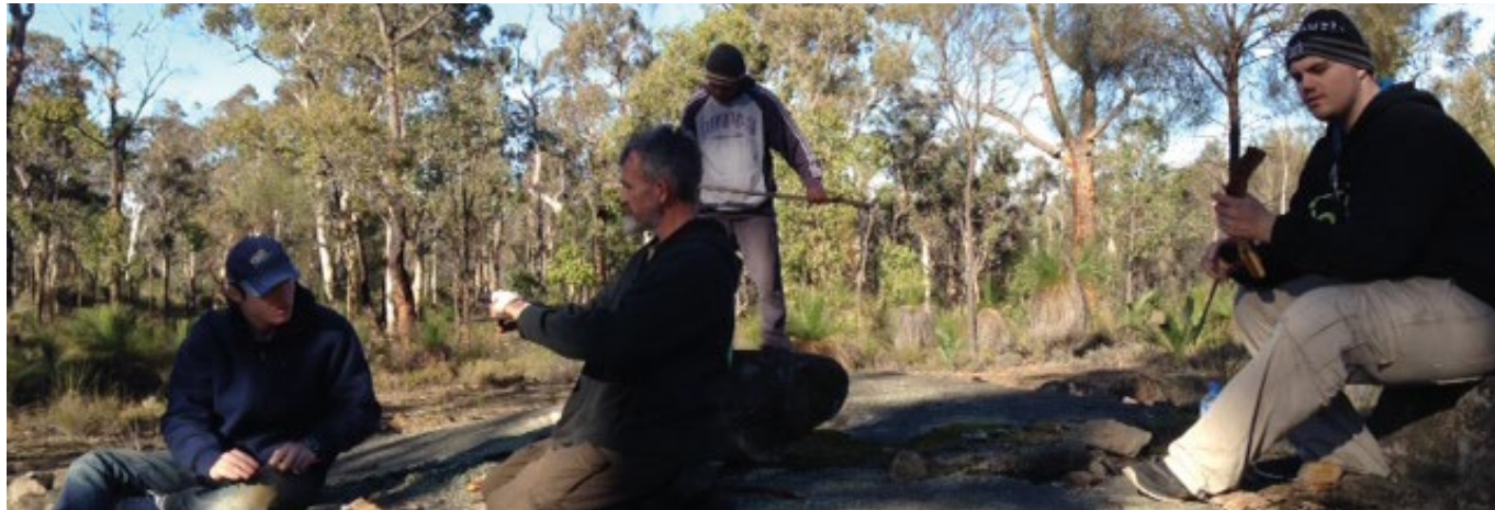
Camping on Country in WA.