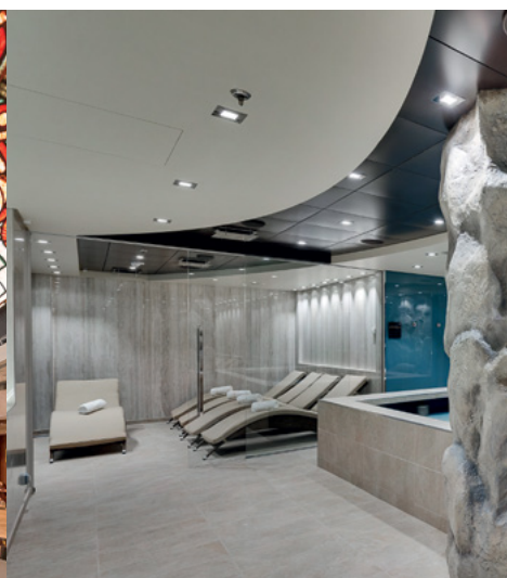
RELAX & REJUVENATE