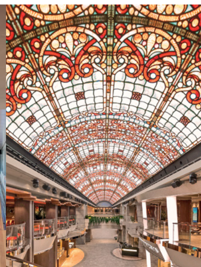
A DAZZLING PROMENADE