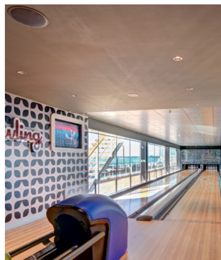
FUN GAMES & ENTERTAINMENT