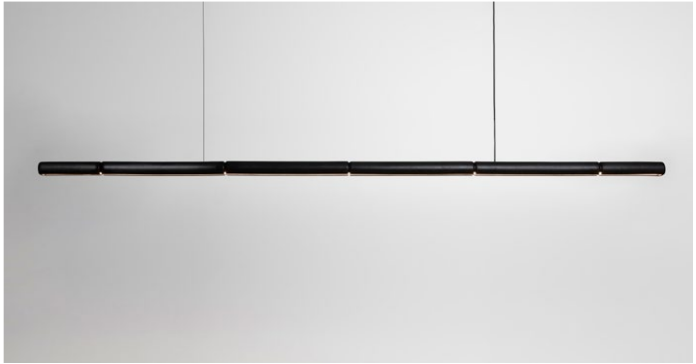
Potter DS, Pendant, 2250 - DS Charcoal