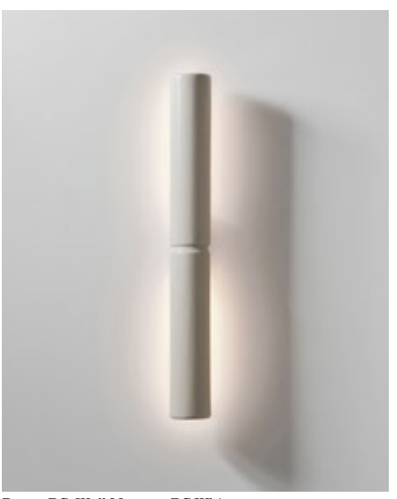
Potter DS, Wall Mount - DS White

Designed by Bruce Rowe for Anchor, the ceramic Potter DS wall and pendant lights are the outcome of a creative and technical collaboration with our long-term lighting partner, Rakumba Lighting and master potter, Michael Skewes. Designed and made using a hybrid process of traditional ceramic techniques and contemporary digital tools, the DS is simple and refined, focusing on the essential beauty of the ceramic form to direct and reflect light. The external simplicity of the handmade ceramic form houses integrated aluminium and acrylic extrusions and a resolved LED lighting solution.