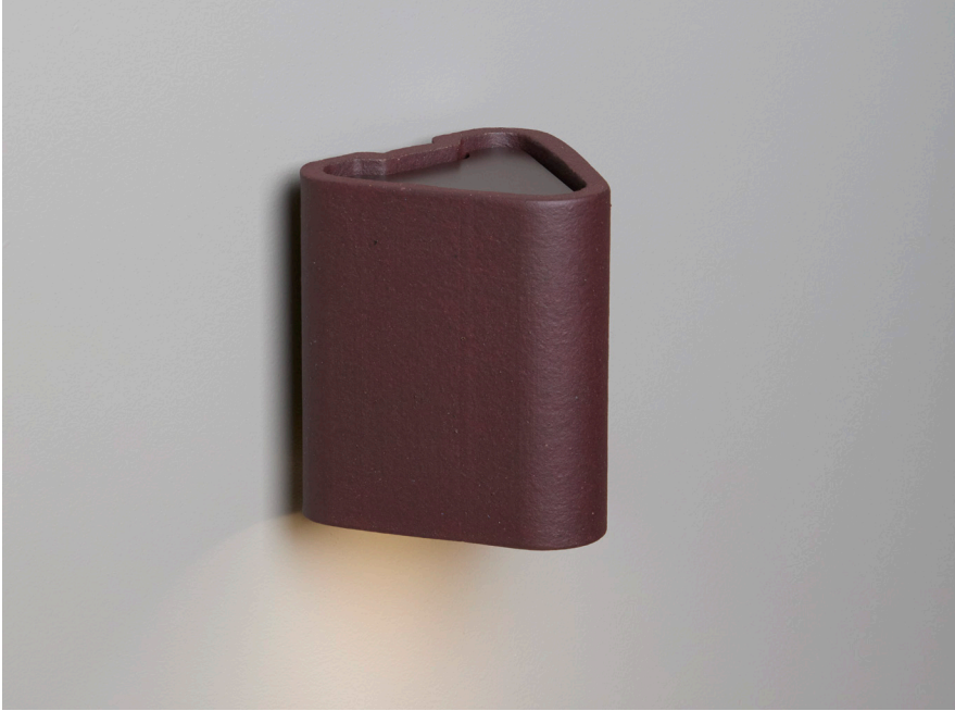
Ridge - Iron Ore