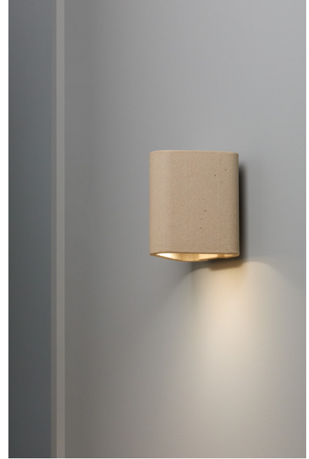
Ridge - Sand