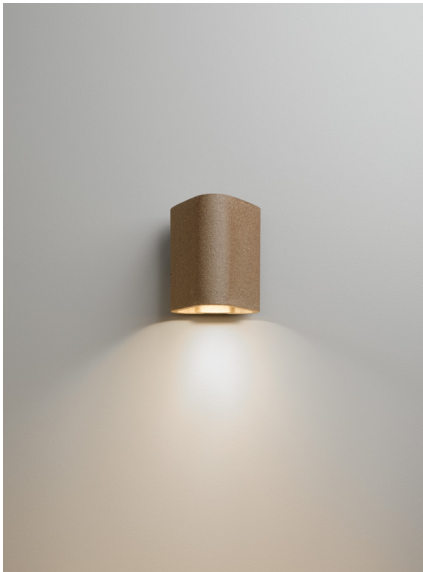
Ridge - Sediment