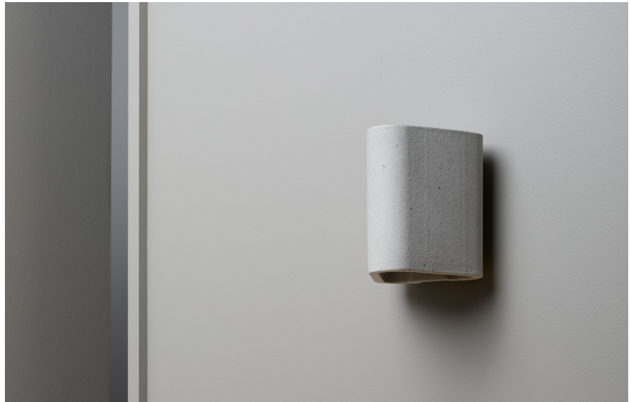
Ridge - Chalk

Designed by Bruce Rowe for Anchor, Ridge is a wall sconce made in Melbourne, Australia that will add warmth, texture and refined simplicity to buildings and interiors. The grounded, three-sided form complements the primary qualities of other Anchor lighting ranges, such as the cylindrical Earth light or rectilinear Flute light. The undulating curved edges and matte surface of Ridge casts light across the form and softens the junction between the fitting and the wall surface.