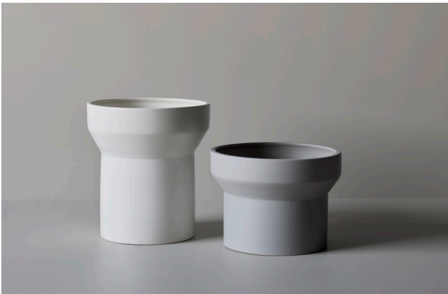
White and Pale Grey glaze finishes