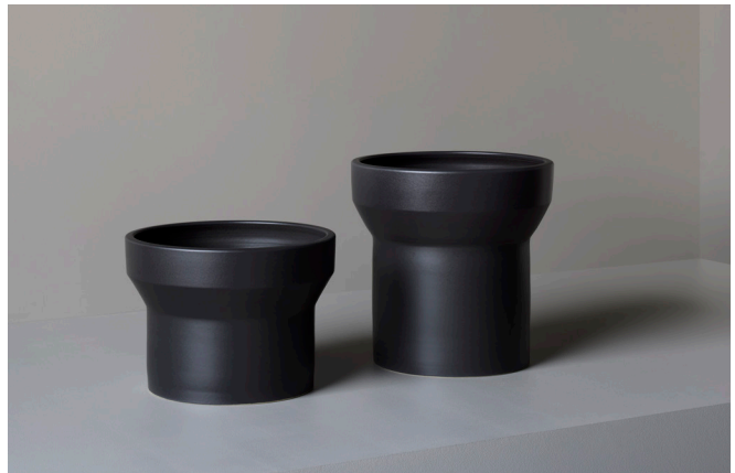
Charcoal glaze finish